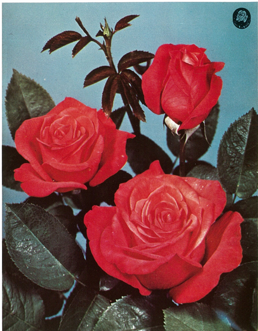
ATOLL H.T. MEIbystar 0734F (1973)