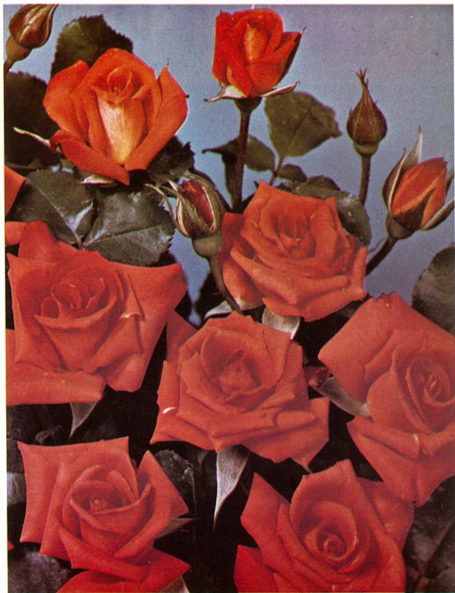
RUSTICANA Floribunda MElleNa 0735F 1973