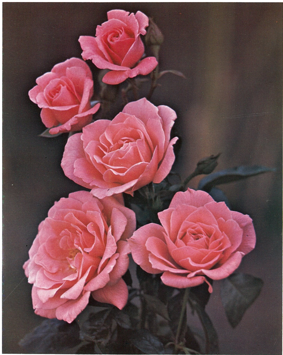
SONOMA FL.B. (SUMATRA x CIRCUS) (5740-A-198) (1973)