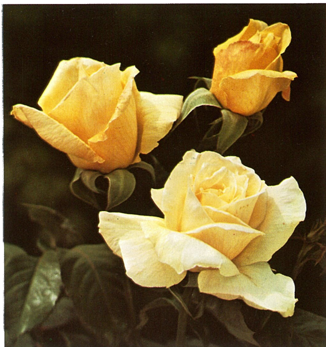
APOLLO H.T. (6334-B-227... 1972)