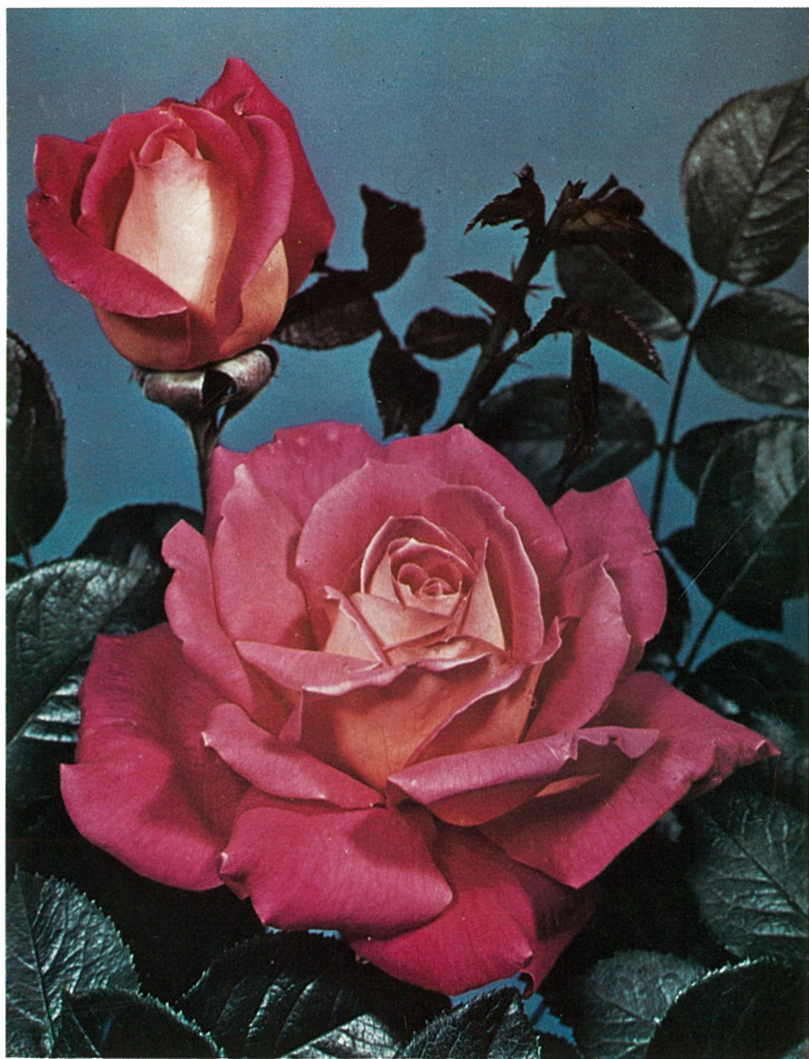
PREZIOSA H.T. MEIhimper 0737 F (1973)