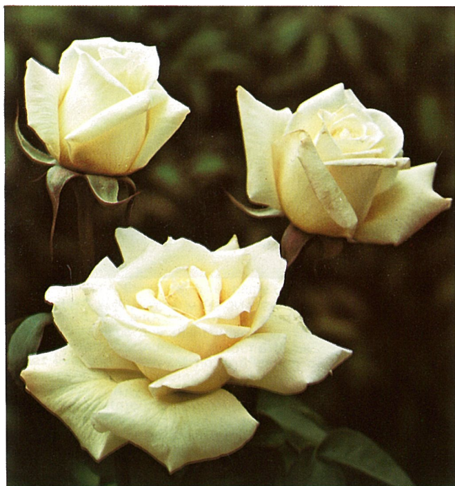
TOUCH OF VENUS H.T. (5879-B-9... 1971)