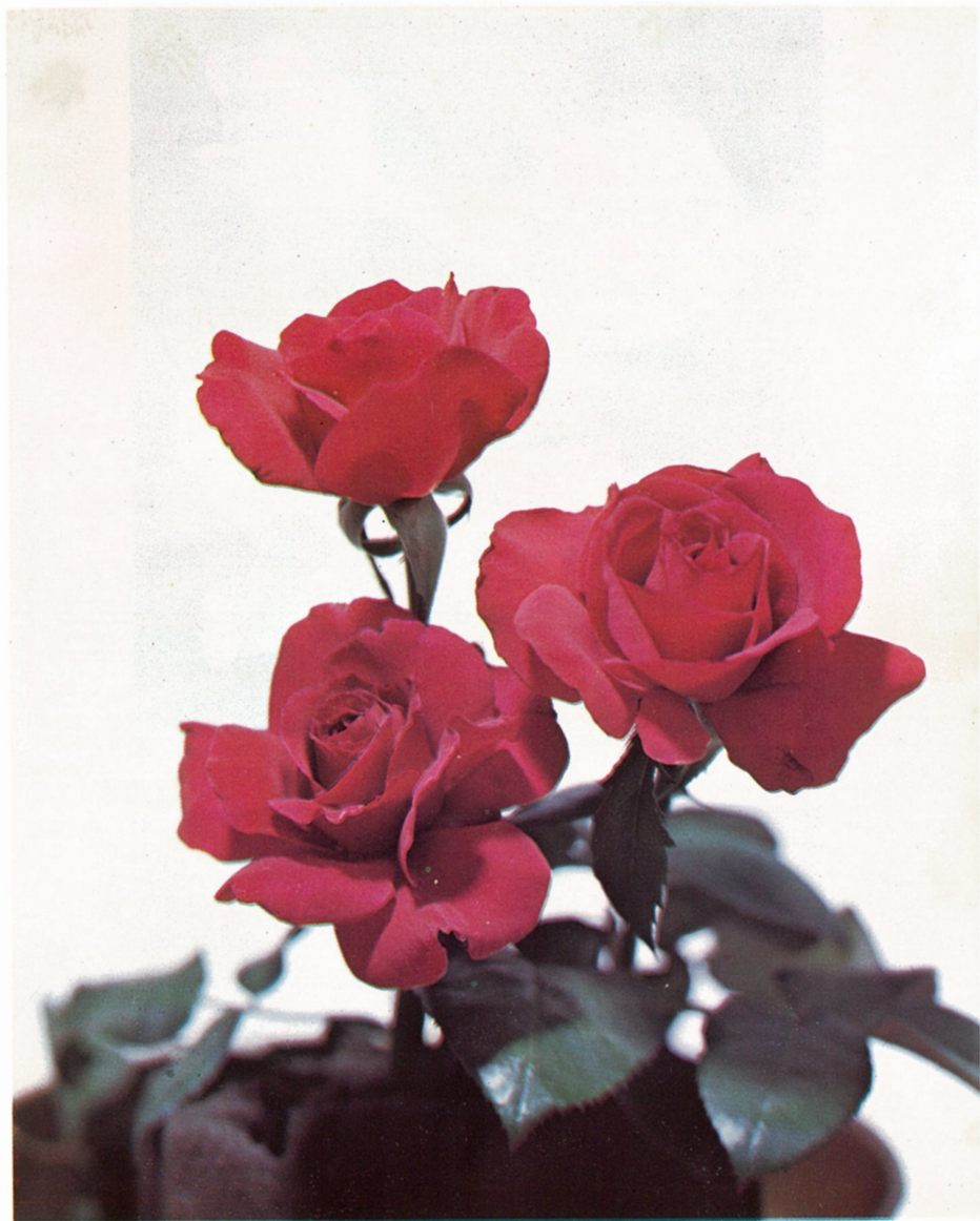
KENTUCKY DERBY H.T. J.S.ARMSTRONG x GRAND SLAM 5933-A-244 1973