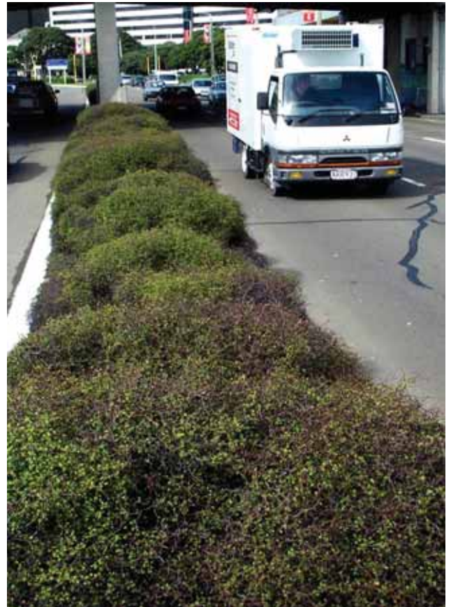
Fig. 6 Muehlenbeckia astonii in a traffic island in Wellington City.