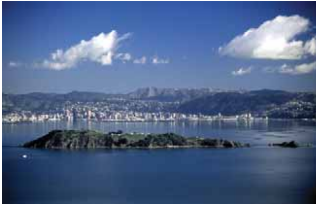
Fig. 2 Matiu/Somes Island — one of Wellington’s three harbour islands.