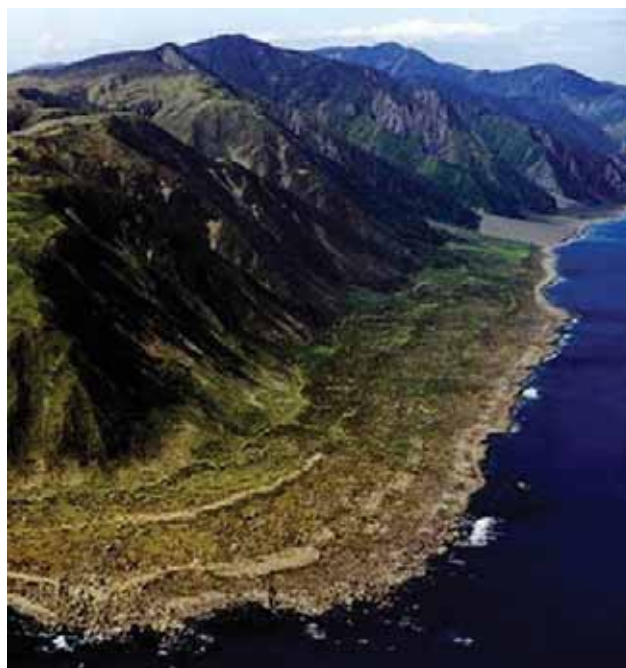
Fig. 8 Turakirae Scientific Reserve — the translocation site for Muehlenbeckia astonii .