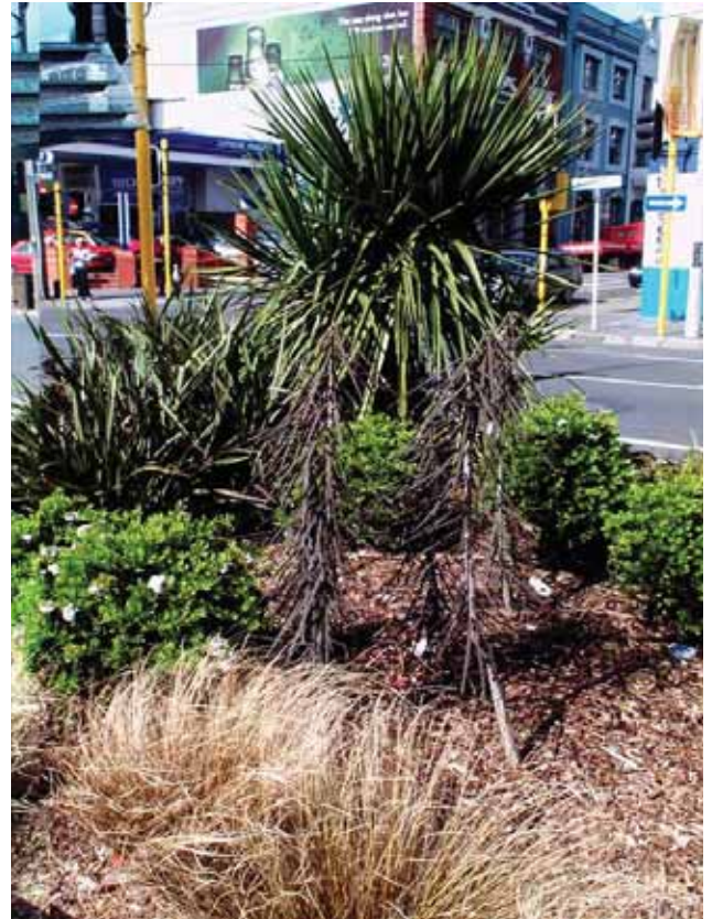
Fig. 3 Common native plants used in a traffic island in Wellington.