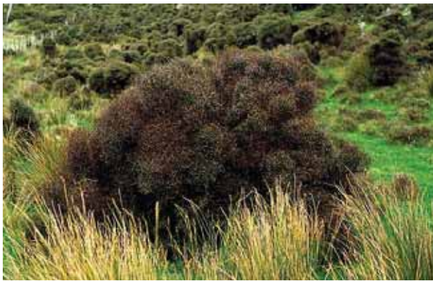
Fig. 4 The nationally endangered shrub — Muehlenbeckia astonii growing in the wild.