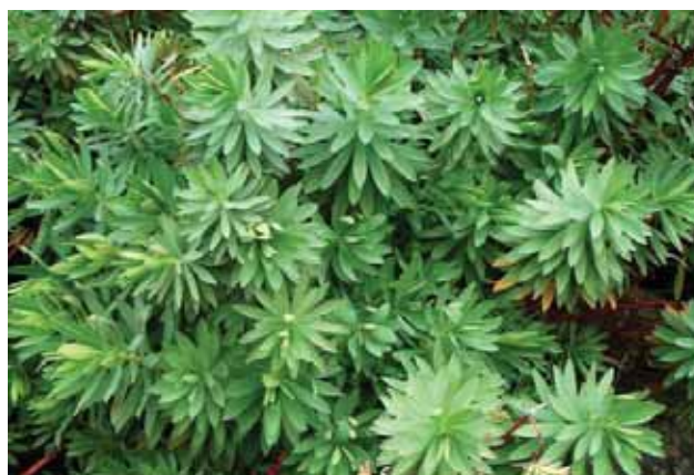
Fig. 9 Euphorbia glauca — a nationally threatened herb found at only one wild site in Wellington.