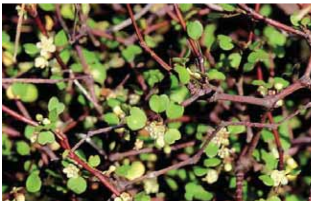
Fig. 5 The common name ‘zigzag plant’ for Muehlenbeckia astonii has come from its divaricating branching pattern.