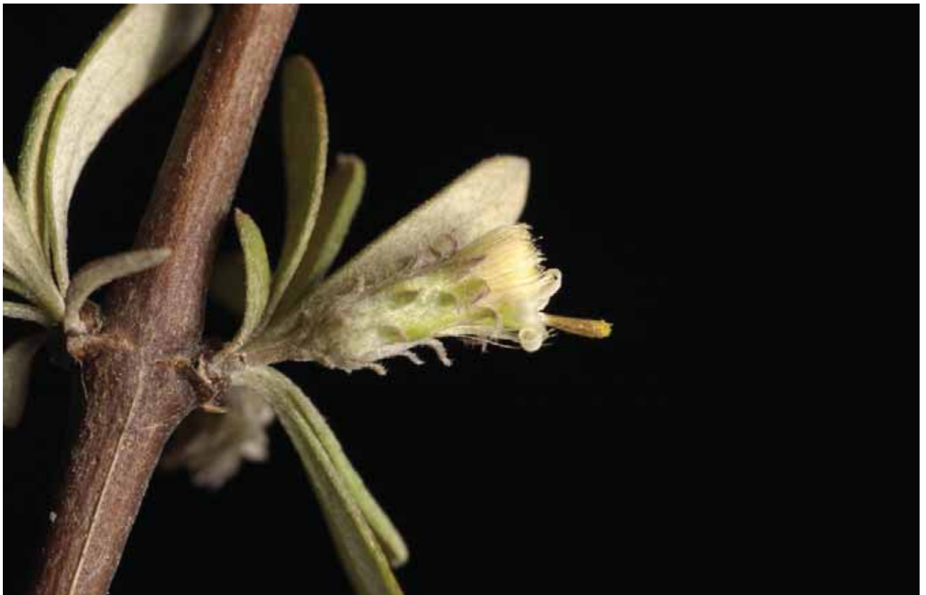
Fig. 2 Olearia adenocarpa . (From CCC 2004, p. 65; photo: M. Walters).