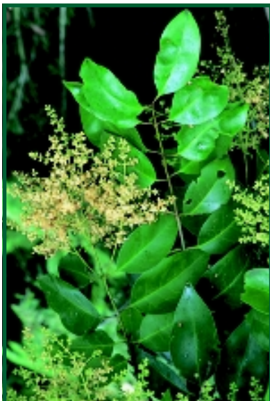
Tree privet flower and leaf

Both Tree Privet and Chinese Privet are native to China. They were introduced to New Zealand as ornamental and hedging plants.