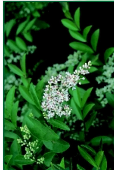
Chinese privet flower and leaf

Both species were first recorded in the wild in the 1950s.