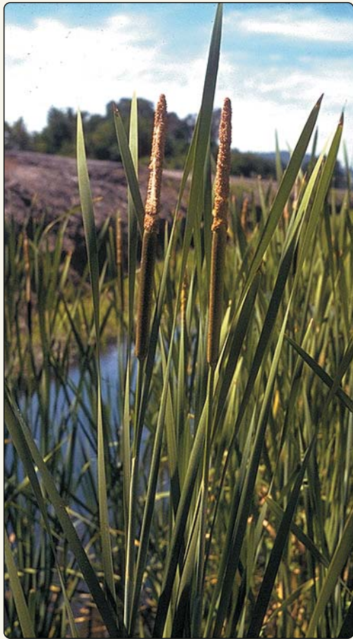
Flowers are erect sausage-shaped spikes

Great reedmace is an erect, perennial freshwater aquatic herb that grows up to 3m tall, very similar in appearance to the native raupo ( Typha orientalis ). It grows on the margins of water bodies in shallow water on a range of different substrates.