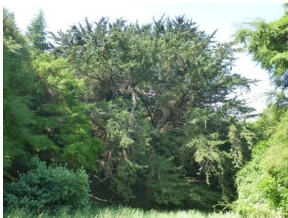
CR/1267 macrocarpa, dominating the far end of a clearing. Photo: Murray Dawson, 30 November 2019.

The New Zealand Notable Trees Trust manages a free public database containing details of many notable and significant trees in this country. The database is constantly being updated. New trees may be entered online at any time, by anyone willing to measure and record the appropriate details (see the website for simple-to-follow instructions). Please feel free to become a tree recorder – your name will be attributed to any tree records and images you submit. The trust welcomes any contributions of information or support. View online at www.notabletrees.org.nz