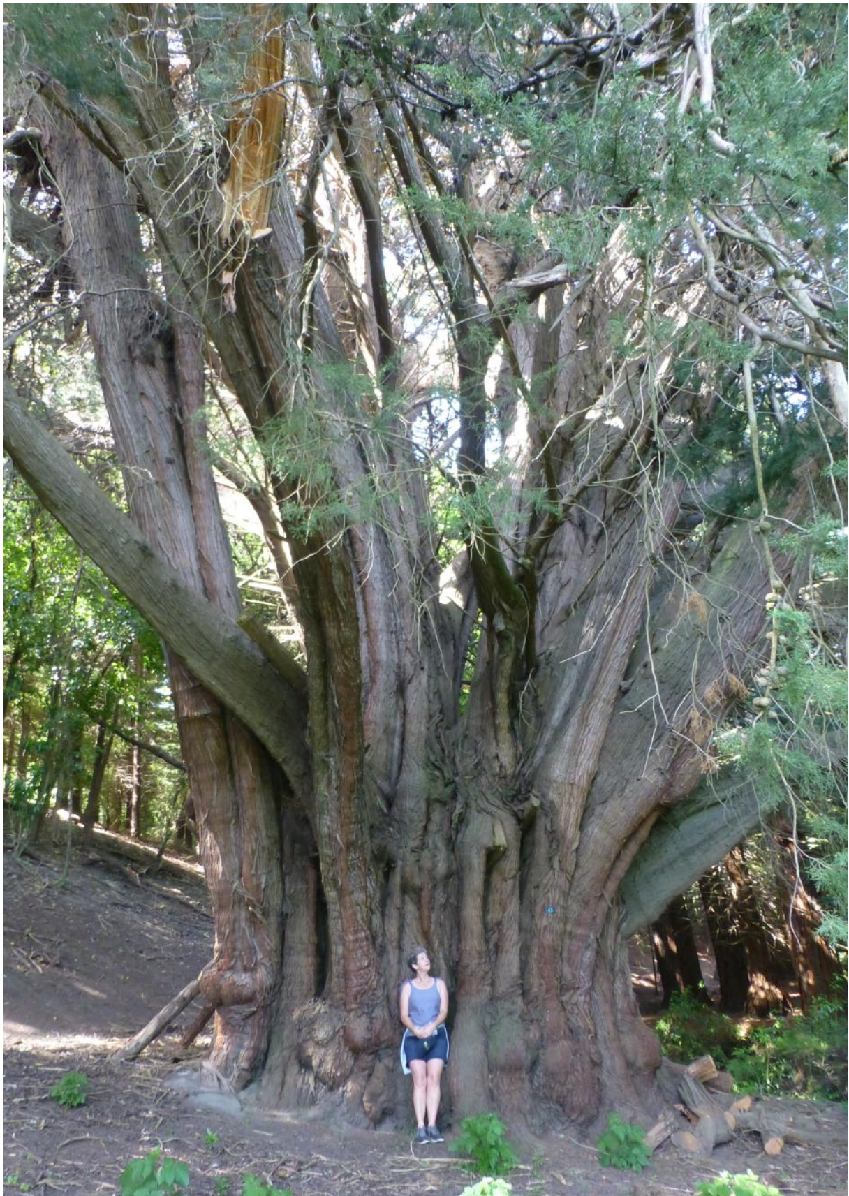
CR/1267 macrocarpa showing its impressive girth, estimated to be 14.6 m. Photo: Murray Dawson, 30 November 2019.