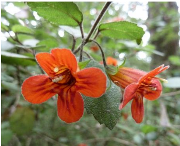
Rhabdothamnus solandri .

The New Zealand Plant Conservation Network held their 16th favourite native plant voting this year. The official victor of New Zealand's favourite plant for 2019 is taurepo, Rhabdothamnus solandri .