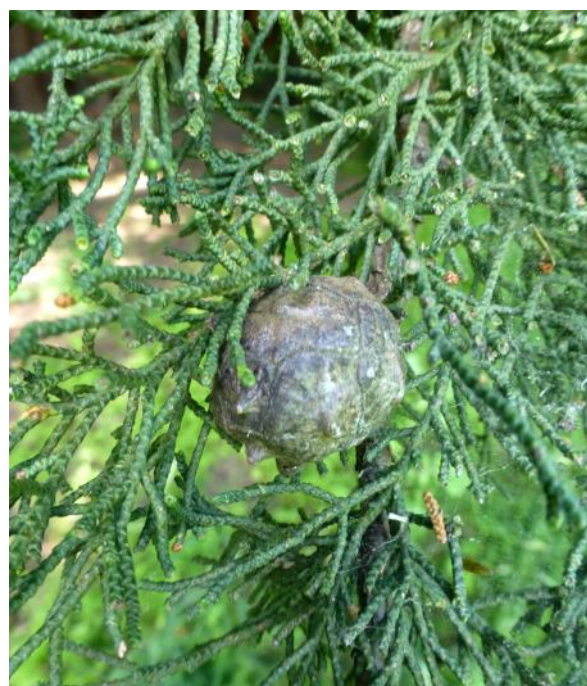
Leaves and female cone of CR/1267. Photo: Murray Dawson, 30 November 2019.