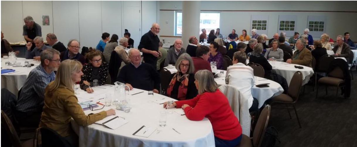
Attendees of the 2019 RNZIH Symposium during the networking session, 24th October 2019.