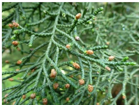
Leaves and male cones of CR/1267. Photo: Murray Dawson, 30 November 2019.