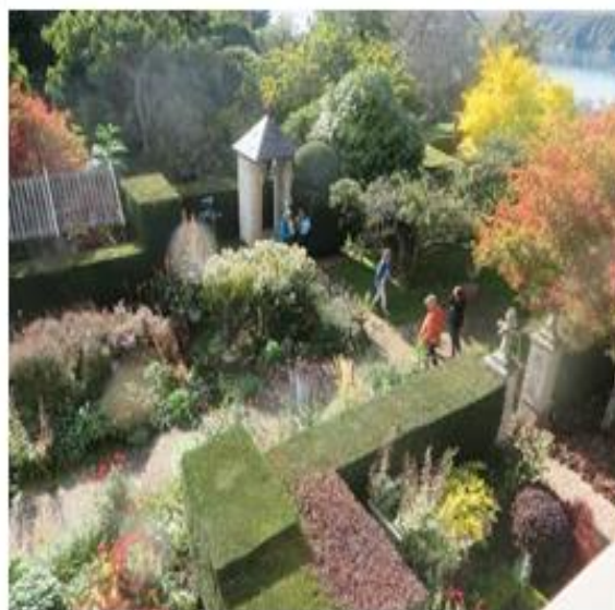
Walled garden at Ohinetahi.