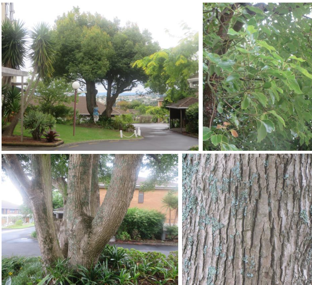
The camphor laurel, Cinnamomum camphora , at Hillsborough Heights Retirement Village, Mt Roskill.

1930. On 13th September 1931, the sisters opened the old house as a home for girls – catering for 35 girls and 10 sisters. Laundry work was the main occupation of the home’s residents, although they also made lace, linen and church vestments. In 1935 tenders were called for a new Girls’ Home on the site. The new building was a three storied concrete residential block able to house 200 girls with a large laundry. Later, the Home closed and the property passed to the Catholic Diocese of Auckland. It was sold to the Chase Private Hospital Group in 1985 who developed the $15 million Hillsborough Heights Retirement Village on the site. Metlife is the current owner operator. The original ‘Arkell’ colonial house is still in use. (See www.aucklandlibraries.govt.nz/en/heritage/localhistory/suburbs/mtroskill/Pages/mtroskill.aspx ).