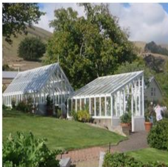
Heritage glasshouses at Annandale.