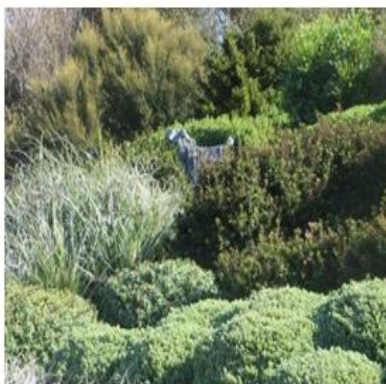
Massed coastal plantings (and goat sculpture!) at Fisherman's Bay.