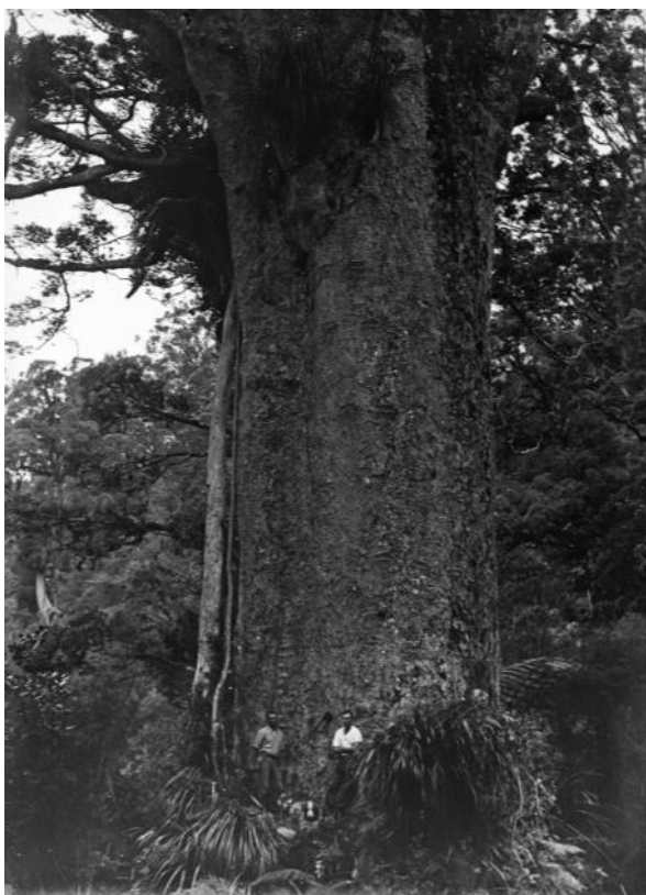
Collins, T.W. Auckland War Memorial Museum Tāmaki Paenga Hira. PH-2013-7-TC-B911-04. CC-BY 4.0.