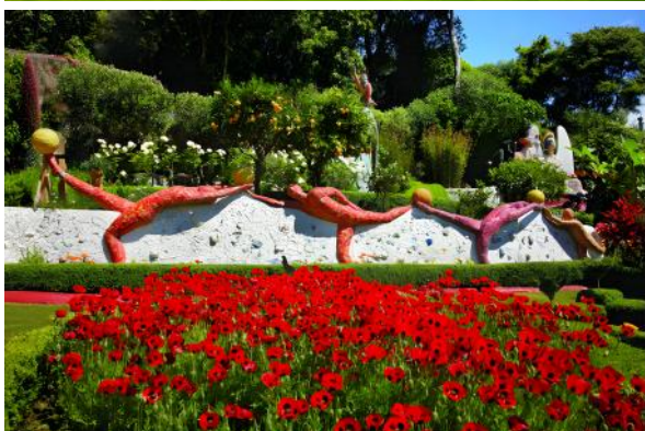
Views of the 'The Giant's House' grounds.