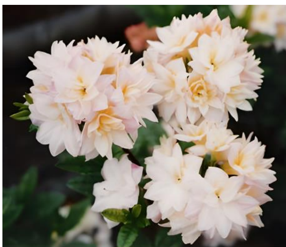
Rhododendron (Azalea) 'Softlights'.