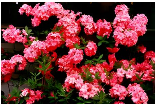
Rhododendron (Azalea) 'Pink Chiffon'.