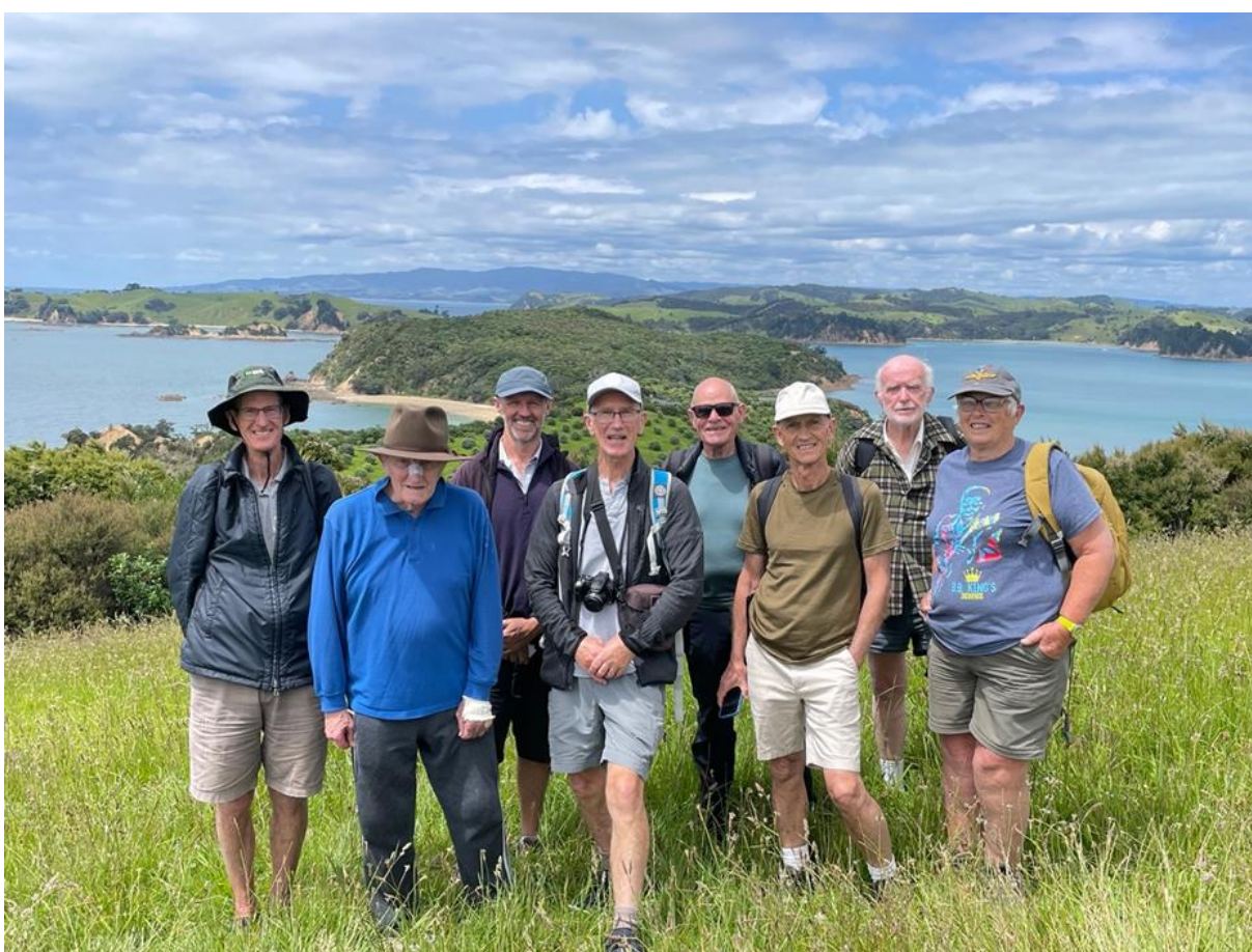
Auckland branch members visiting Rotoroa Island, 3rd December, 2022.

There were no nominations for the McPherson prize this year.