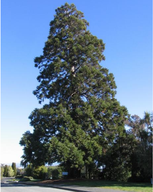
The Songer Tree.

Previously published in the NZAA Tree Matters, Edition 48, Summer 2010, Vol. 12, Issue 4.