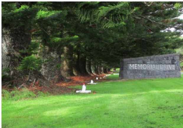
Memorial plantings of Norfolk Island pines.

You can be forgiven for passing this fine row of trees without stopping. I grew up in Takapuna and later flatted in Devonport for many years and until last month never took the time myself to stop for a closer look. Two large stone walls mark the 280 metre long stretch of Lake Road between Seabreeze Road and Ariho Terrace as Memorial Drive. Information panels explain that the 28 Norfolk Island pines and the row of pōhutukawa, that flank the other side of the road, is a commemorative planting established to honour Devonport's sons who were lost in the Second World War 70 years ago.