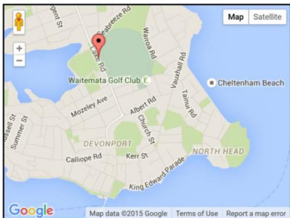
Location of Memorial Drive, Devonport, Auckland.