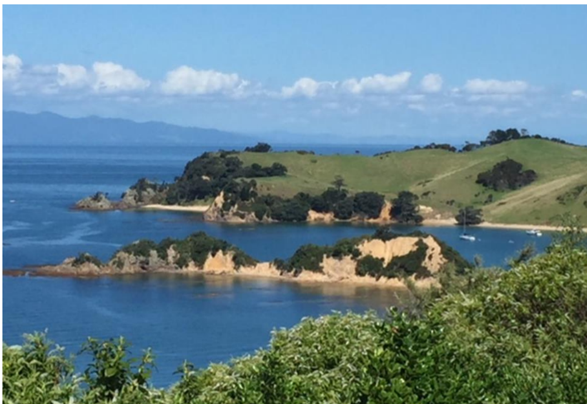
Views from the summit at Rotoroa Island, Hauraki Gulf.