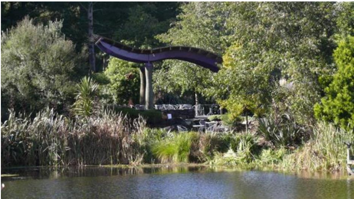
The dramatic shelter structure at Waitakaruru Arboretum and Sculpture Park.