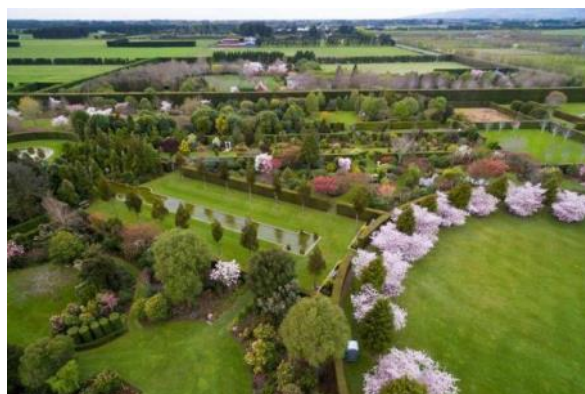
Broadfield NZ Landscape Garden. Photo: NZ Gardens Trust ( www.gardens.org.nz/christchurch-canterbury-gardens/broadfield-nz-landscape-garden/ ).

David Hobbs (Christchurch) owns and established the 3.5-hectare Broadfield NZ Landscape Garden on the outskirts of Christchurch 27 years ago.