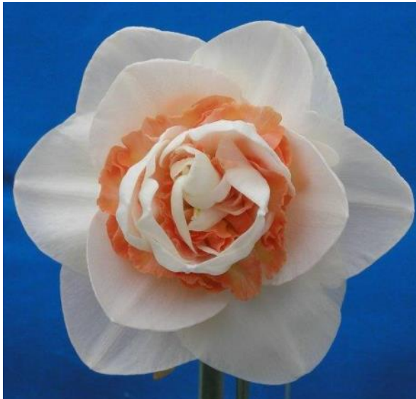
'Cosmic Image' (2016) produces very good symmetrical double white flowers with cerise red centres. It is part of John Hunter's "Cosmic Series" of selections.