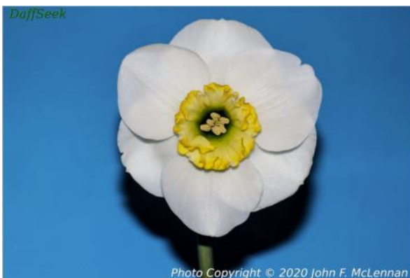
'Green Topaz' (2010) received a Certificate of Preliminary Commendation in 2019 by the RHS in England. The English growers that gave this award thought it was one of the best green cups daffodils they had seen.