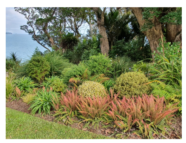
Omaio, a six-star Garden of International Significance.

Upcoming Branch AGM – Sunday 21 April 2024 – Fernglen Gardens, 36 Kauri Rd, Birkenhead