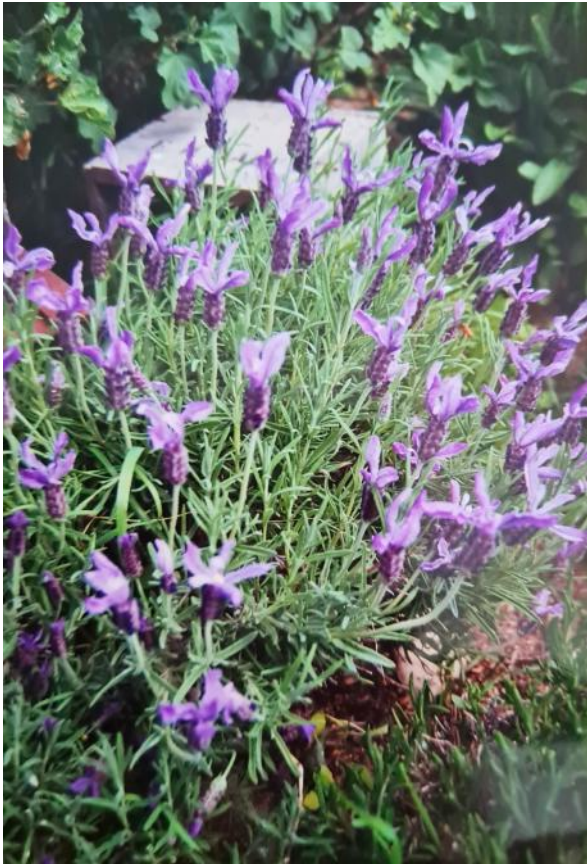
Lavandula stoechas 'Myrleigh'.