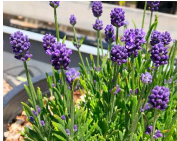
Lavandula angustifolia 'La Petite Blue'.