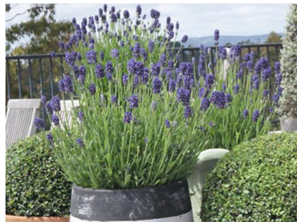
Lavandula angustifolia 'Thumbelina Leigh'.