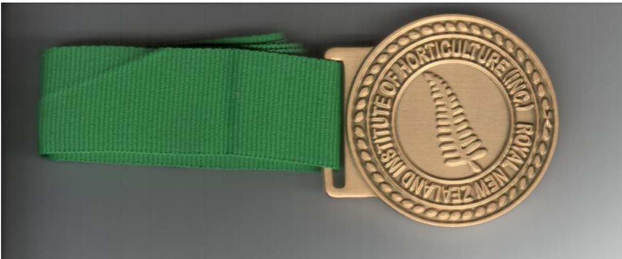
RNZIH award medal.