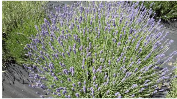
Lavandula angustifolia 'Azure Leigh'.