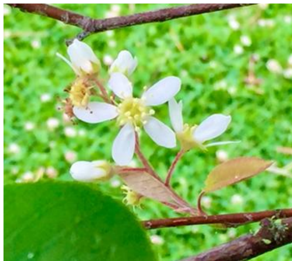
Amelanchier canadensis (serviceberry or shadbush).

After the business was completed, we took a stroll around the expansive grounds, taking in various trees including the avenue of huge Moreton Bay figs ( Ficus macrophylla ), the native milk tree ( Paratrophis microphylla ), the delicate serviceberry ( Amelanchier canadensis ) and a mighty tulip tree ( Liriodendron tulipifera ).