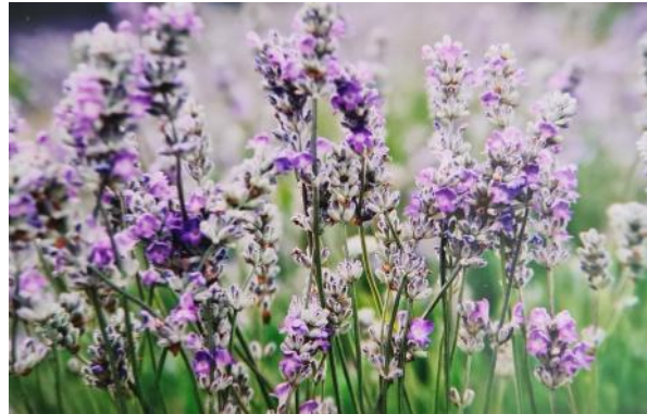
Lavandula angustifolia 'Grace Leigh'.