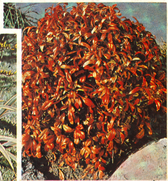
NANDINA DOMESTICA PYGMAEA