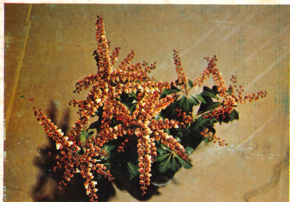
PIERIS PINK DELIGHT