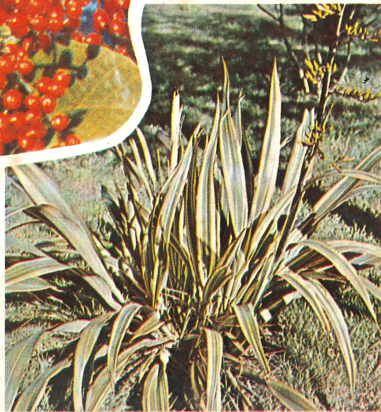
PHORMIUM COOKIANUM TRICOLOR