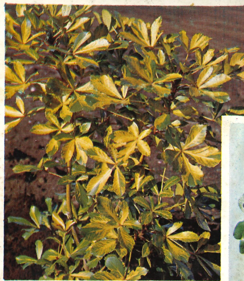
PSEUDOPANAX LESSONII GOLD SPLASH