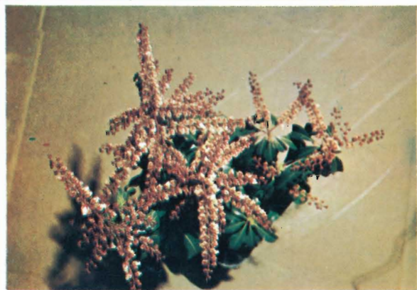
PIERIS PINK DELIGHT