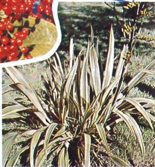
PHORMIUM COOKIANUM TRICOLOR