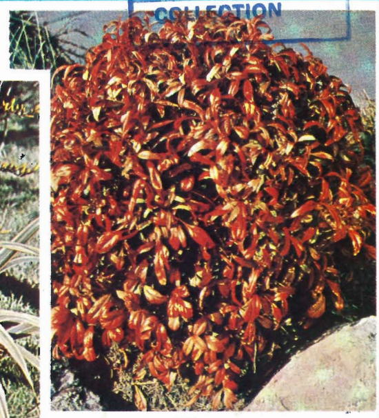
NANDINA DOMESTICA PYGMAEA