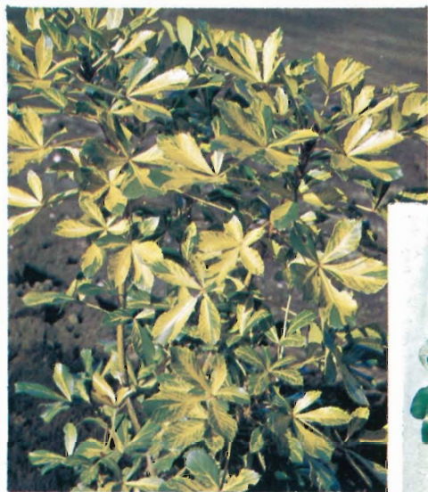
PSEUDOPANAX LESSONII GOLD SPLASH