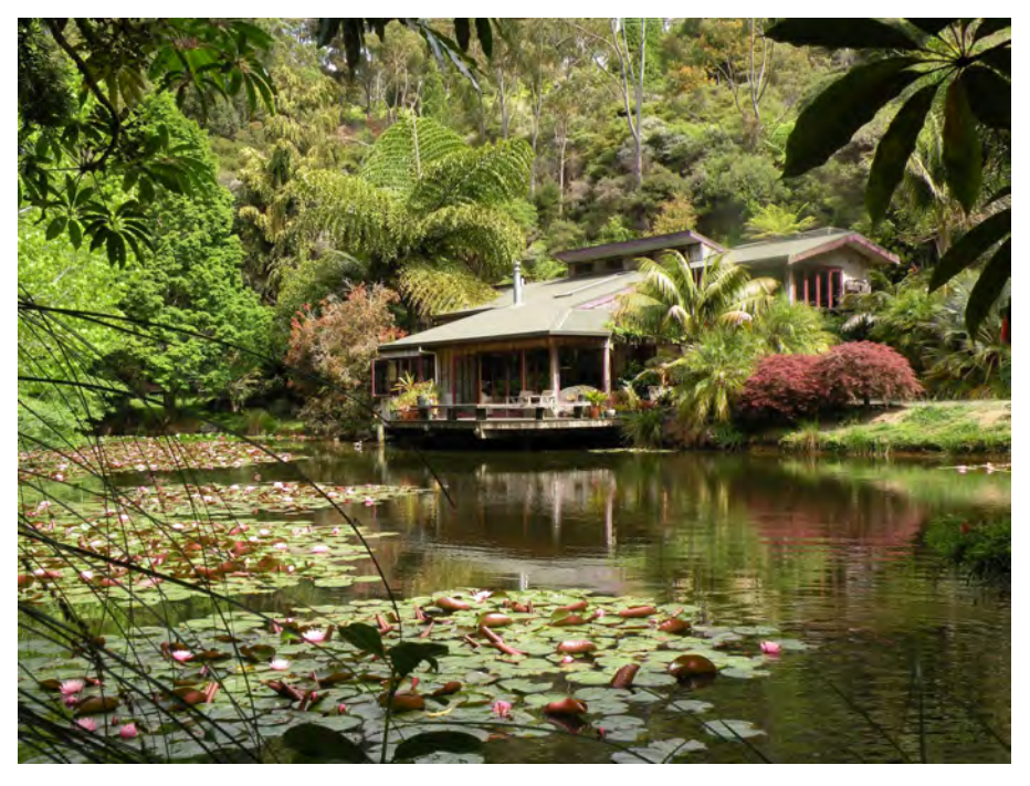
Fransham's house at Matapouri Bay nestles into the lake edge, catching the sun all day.

Obituary compiled by Mei Leng Wong, and reproduced courtesy of NZ Gardener magazine.