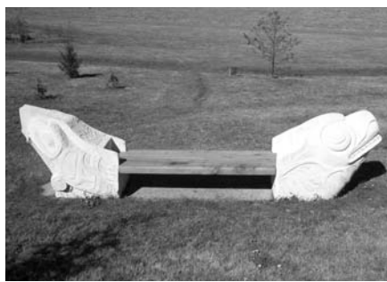
A seat of special significance for the Seattle Garden created by Doug Neil.

The City Council Parks Planning Department offered five sites within the city for consideration as the location of the Sister Cities Gardens. These were the Styx Mill Reserve, Nunwick Park, Curletts Road Reserve, Halswell Quarry Park and Huntsbury Reserve. In the selection process a defined set of criteria for the requirements of the international gardens was followed. Suitable soils, drainage, access, site microclimates and location were given high ratings. Halswell Quarry Park met these very closely, but there was disapproval