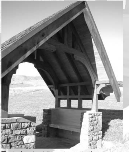
The lych gate at the entrance to the Christchurch (UK) Garden.

The Christchurch City Council set up a steering committee in 1994 to investigate and report on proposals to celebrate the Millennium. The year 2000 also coincided with the 150th anniversary of the founding of Canterbury. The Trust Bank Community Trust provided core funding for the City Council to formalise, control and oversee the numerous projects and events that were being planned, and leaders from a wide range of educational, cultural, historical, arts and sporting