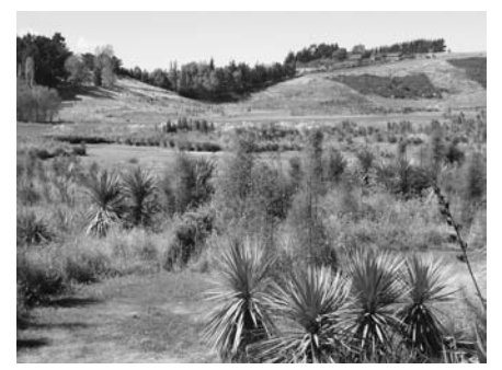
The Canterbury Native Plant Garden.

from some local residents of the plan to establish exotic plantings within the Quarry Park. Some preferred that native plants only be used, despite the park already being studded with many exotic trees from a variety of countries. A public hearing regarding a change of use to the management plan for the park received approval [2].