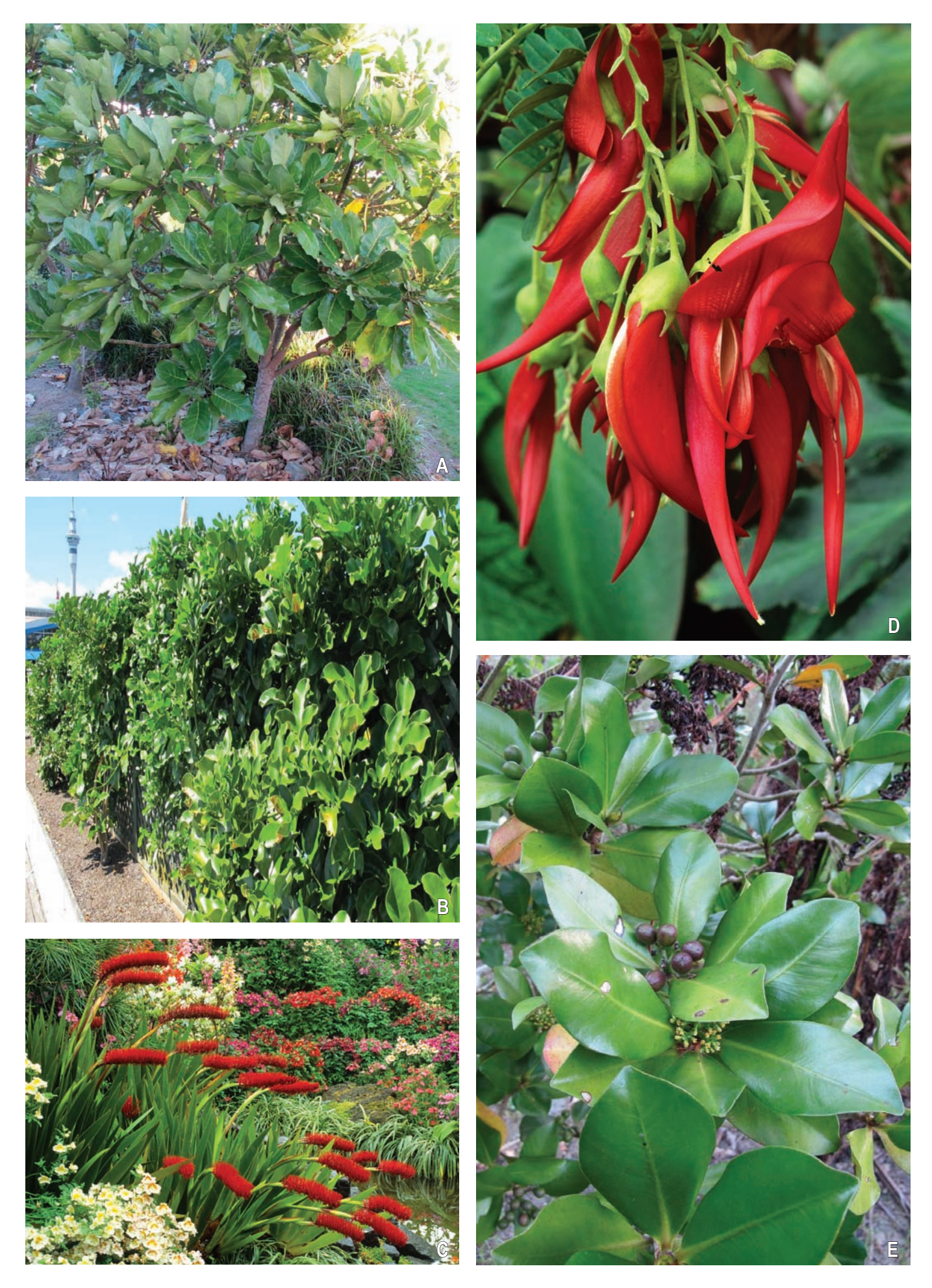
Fig. 1 New Zealand native species that are threatened in the wild but now common in cultivation. A , Meryta sinclairii . Image: Lyndale Nurseries. B , Tecomanthe speciosa . Image: Lyndale Nurseries. C , Xeronema callistemon . Image: Jack Hobbs. D , Clianthus maximus . Image: Jack Hobbs. E , Elingamita johnsonii . Image: Lyndale Nurseries.