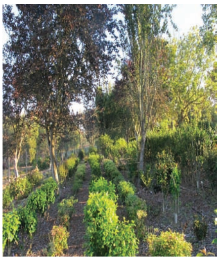
Fig. 3 A portion of the stock beds at Lyndale Nurseries showing recently reassessed and replanted material with representatives of only the commercially desirable plants.

Those are but a couple of positive examples; the sad reality is that as nursery propagation requirements are fine tuned to minimize costs, nursery stock beds are re-evaluated and reduced. Lyndale went from some 10 hectares of stock plants to retaining only one hectare (Fig. 3).