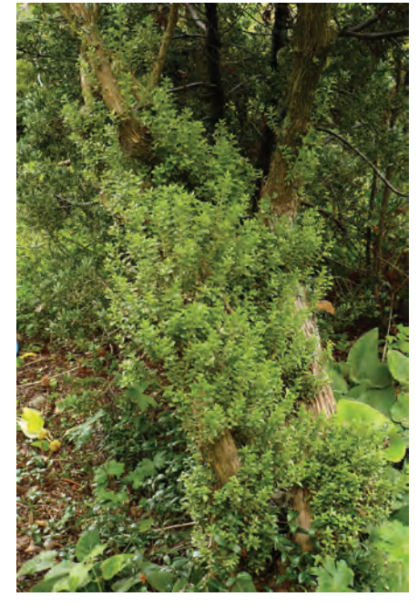
Fig. 2 Olearia 'Lochiel' sprouting from old wood after being heavily trimmed.

from longevity and slow, compact growth, qualities it shares with box, an attribute that makes this hybrid olearia particularly suitable for hedging is that like box it can be kept compact by regular trimming and has the ability to sprout from very old wood when cut back heavily (Fig. 2). Conveniently, it strikes as readily as box does from semi-ripe cuttings.