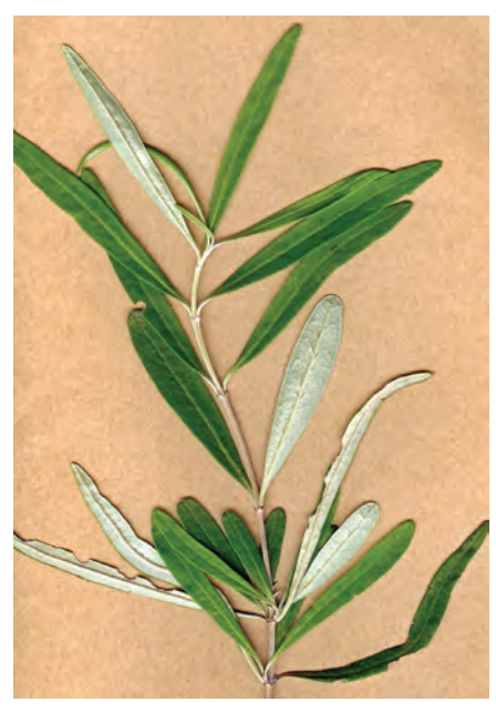
Fig. 5 Olearia lineata 'Dartonii' foliage.

Olearia lineata in the strict sense occurs on the West Coast from Lake Brunner southwards, on Stewart Island, and in inland South Canterbury and Otago. However, from a horticulturist's viewpoint this tree daisy is of interest only for its larger-leafed cultivar O. 'Dartonii' (Fig. 5).