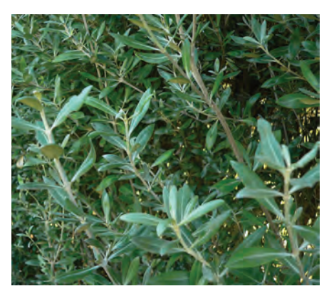
Fig. 6 Olearia 'Saunders'.

The long-defunct Saunders nursery was well known in its day as a distributor of good forms of native plants and is remembered for several clones, including Pittosporum 'Saundersii'. Olearia 'Saunders' (Fig. 6) bears some resemblance to typical O. traversiorum and has a similar growth habit but is marginally more vigorous and somewhat more drought tolerant. It has narrower, silver-tinted rather than green, leaves. It is easy to establish and tolerant of wind and heavy frosts. Branches were broken from plants growing in Central Canterbury in the major snowstorms of June 2006, and June 2012, but growth quickly recovered when spring arrived and the cultivar was otherwise unharmed, despite the severe cold that accompanied the snow. Cuttings of this clone strike readily in late summer or early autumn. The late David Given (pers. comm.) suggested that the unknown second parent may be O. xmollis.