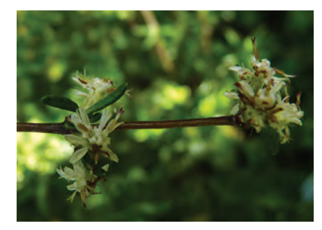
Fig. 4 Olearia lineata flowers.

leathery on top. Nurseries nowadays seldom stock it, but it is well worth reintroducing. It can be grown fairly easily from cuttings.