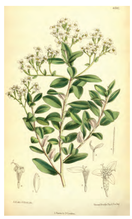
Fig. 3 Botanical illustration of Olearia xhaastii in Curtis's Botanical Magazine, London, Vol. 107 (= Ser. 3, Vol. 37): t. 6592, 1881.

mix), and watered regularly, it was still covered with green shoots and well along the road to recovery.