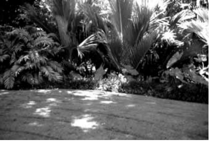
Fig. 3 A designed garden showing structure, form, aesthetics and potential for change.

The role of plants in the designed garden may be to provide form, structure, beauty, and change (Fig. 3). Mark Johnson (1999) suggests that garden aesthetics emphasises order, continuity, orientation, sensations of beauty and place, a sense of care, and so on.