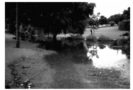
Fig. 4 Wairaka Stream in flood the year previous to our trial.

Our trial planting design was selected to give each species an equal chance of being close to the stream edge, so we used a Latin Square layout - not dissimilar to two adjacent 8×8 SUDOKUs. Plants were evenly placed at 0.5m spacings. Two Auckland sites were chosen to implement the trial. One site was at Unitec, beside the Wairaka Stream in Mt Albert. The other was on private land beside the Waikumete Stream in Glen Eden. Both streams have a history of flooding. The Wairaka on average floods over its banks three times per year and is not atypical of suburban streams in size and disturbance regime (Fig. 4).