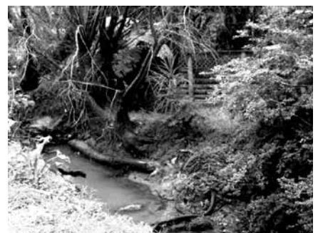
Fig. 1 An Auckland urban stream which has been abandoned.

seen as an amenity or a liability and therefore treated 'in a manner not consistent with the rest of the property'. Even in more public places such as the Unitec campus in Mt Albert, Auckland, streams are seen as problematic (Fig. 2). The 'backyard biodiversity' concept (Brakey, 2005; Meurk, 2003) extends indigenous riparian plantings beyond public space to include streams through private property. This strategy may not necessarily be the most desirable approach, however, for streams which flow through private gardens, where cultural expression of a different aesthetic can be important.