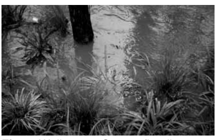
Fig. 7 Waikumete Stream flooding, immersing some plants and depositing debris.

There were three coinciding flood events for both sites during the trial period. At the Wairaka Stream, none of these events were intense enough to overtop the bank. Modifications to the stream system occurred upstream during the period of the trial, increasing the holding capacity during flood events resulting in the reduced flood effect - unfortunate timing for the purposes of our trial. At the Waikumete Stream two of the flood events impacted on the trial area, one covering the majority of the plants (Fig. 7).