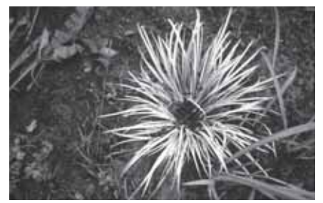
Fig. 8 Acorus gramineus post-flood with debris deposit.

General visual health of the plants was greatest in the sunny site. Flowering overall was greatest in the sunny conditions with Zantedeschia and Hemerocallis having the most showy flowering. The grasses, sedges and Euphorbia rely on their form and/or foliage colour for aesthetic values. The appearance of Acorus is the least affected by harsh conditions except for collecting debris as the flood event receded (Fig. 8). This had visual impact rather than being a detriment to health and the effect was minimal and gradually diminished over time.