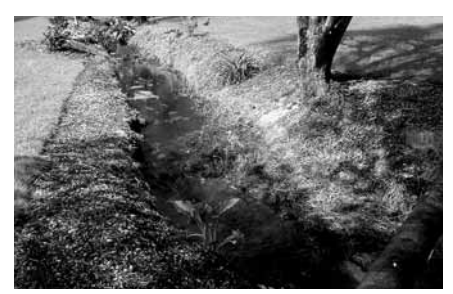
Fig. 2 Unitec campus: Wairaka Stream has little amenity and ecological value.

By their very character gardens are rarely ecologically stable and therefore require continuous maintenance. The current ecological landscape design paradigm looks to integrate the