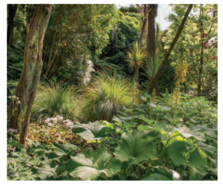
Fig. 6 The woodland garden.