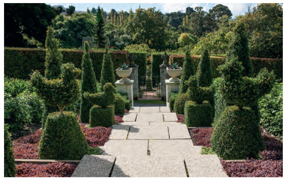
Fig. 9 A view of the garden as it is today.

Several of New Zealand's greatest contemporary private gardens were developed over many decades by the original owners – Margaret Barker of Larnach Castle and Bev McConnell of Ayrlies are two that immediately come to mind. For a great garden to endure and become intergenerational, as has happened for the historic gardens of England, trusts need to be established and plans put in