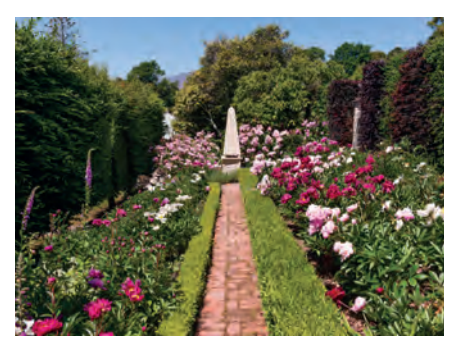
Fig. 5 The peony garden.