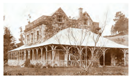
Fig. 2 1900s photograph of the house and grounds in a most neglected state.

Soon after moving in, they embarked on an extensive restoration of the house to make it more liveable, and much work was needed. It also fell into neglect earlier, in the 1900s (Fig. 2). As a professional architect, Sir Miles freely admits that "Ohinetahi must have accumulated more drawings per cubic metre than any other New Zealand house"! We read in a later chapter that Pauline and John left Ohinetahi after 12 years, but Sir Miles stayed on.