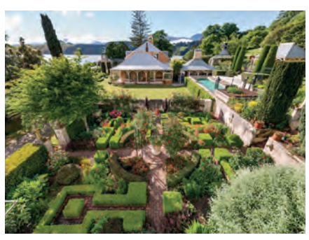
Fig. 4 Aerial view of the restored house and newly created red garden.

Building upon this plan came a potager (traditional kitchen garden), themed plantings – a red garden (Fig. 4), and plantings of camellias, daylilies, peonies (Fig. 5), rhododendrons and magnolias – a woodland garden (Fig. 6) and native bush walk (in the formerly overgrown lower part of the garden), and, more recently (Fig. 7), a park-like setting and amphitheatre (following the purchase of some neighbouring land). Representative plants used are listed for many of these garden areas.