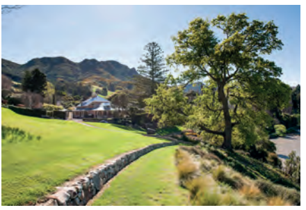
Fig. 7 Broad view of the house from the park.

Hard structures include the pool and pool house, swing-bridge, viewing tower, sundial, folly, gazebo, garden walls, paths, steps, columns, and numerous garden sculptures.