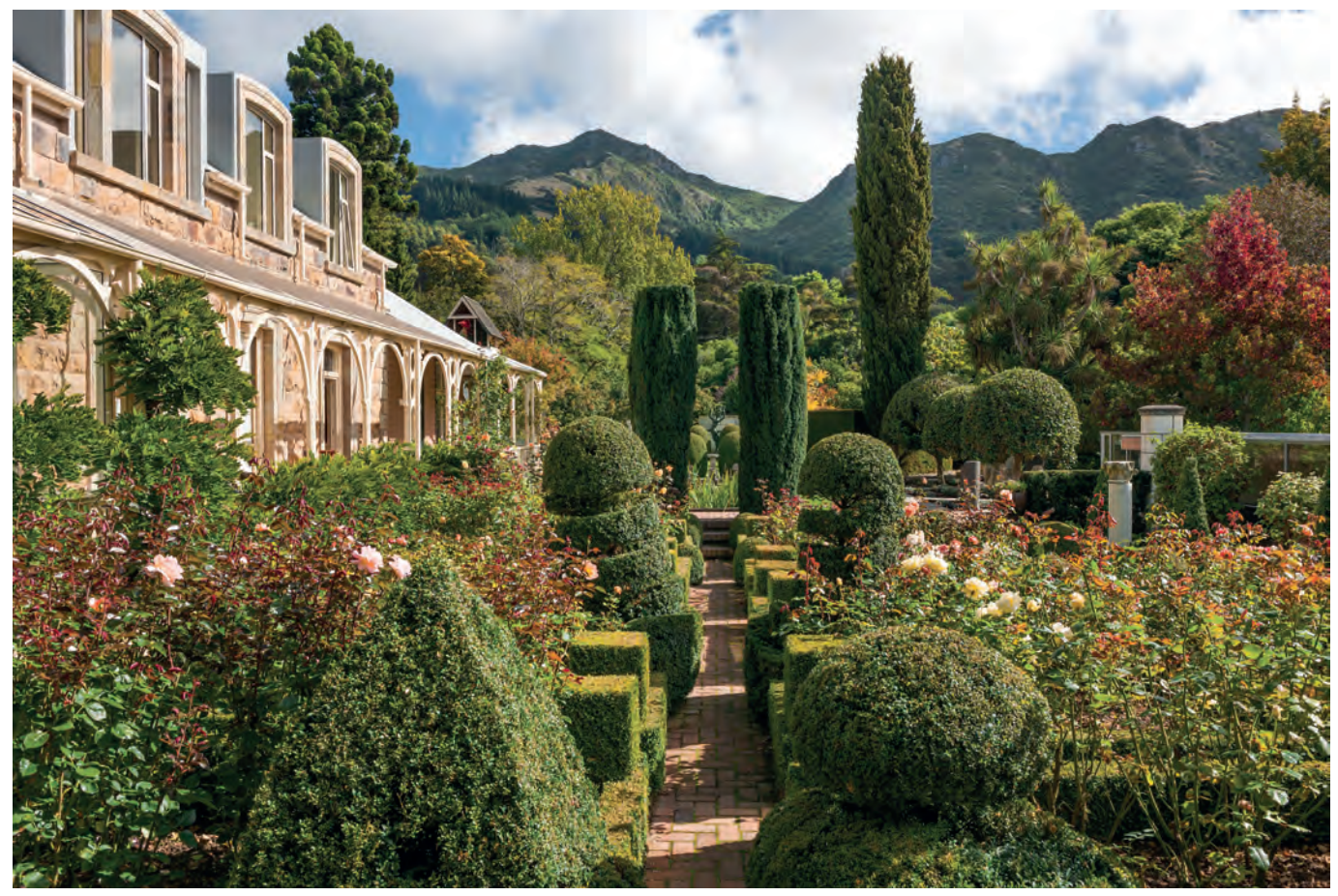
Fig. 8 North front of the house and garden.

Ohinetahi has been awarded the six-star maximum by the RNZIH New Zealand Gardens Trust (NZGT; see www.gardens.org.nz/christchurchcanterbury-gardens/ohinetahi). This means that Ohinetahi garden provides one of New Zealand's top garden experiences, and achieves and maintains the highest levels of presentation, design and plant interest throughout the year. Six-star gardens are described as the complete package which inspire garden lovers and deliver an experience above all