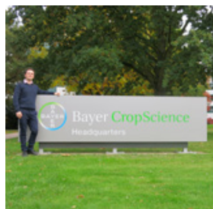
Fig. 6 Outside the Bayer CropScience headquarters at Monheim, Germany.

At the end of my journey, I travelled to Cologne, Germany, to visit the crop science division of Bayer (Fig. 6). As one of the sponsors of the YHOTY competition, Bayer was very supportive in giving me the opportunity to visit their facilities in Germany. The chemical compound bank was significant, while the processing and research facilities were impressive. It was a great insight into the production of agrichemicals used in horticulture.