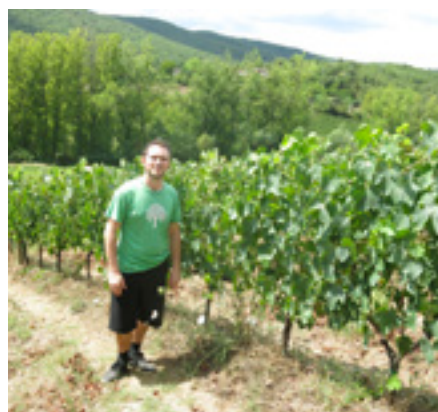
Fig. 1 A vineyard in the Chianti region of Tuscany, Italy.

During my travels, I visited the Italian winegrowing regions of Tuscany and Veneto, and the French regions of Sancerre, Champagne, Alsace, Côte Rôtie and Burgundy. The focus of these travels was to view a diverse range of viticultural regions, expanding my ideas on viticulture, creating an international network and enjoying the cultural differences and experiences that Europe has to offer.