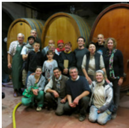
Fig. 4 The harvest team at Meyer-Fonné winery, Alsace, France.

'Pinot Noir' and 'Chardonnay' grape varieties; and Côte Rôtie, the home of Syrah (Shiraz). I gathered insights into grape varieties that are integral to the New Zealand wine industry. Burgundy is extremely focussed on the importance of place, and as a result, the area of origin of the vines is inextricably linked to the value of the wine.