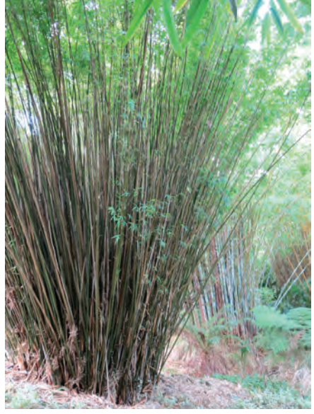
Fig. 2 Himalayacalamus falconeri.

offered for sale by a seed company in Thailand. The germination rate was listed as 70 per cent. Obviously it flowers in its native Chile also, because the plant in my garden was raised from seed collected (not by me) in southern Chile.