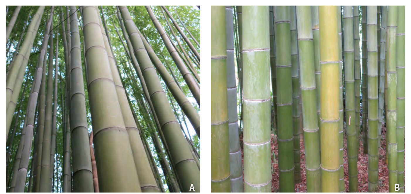
Fig. 3 Phyllostachys edulis. A, grove showing the spectacular tall growth habit. B, close-up of stout canes which are technically called culms.