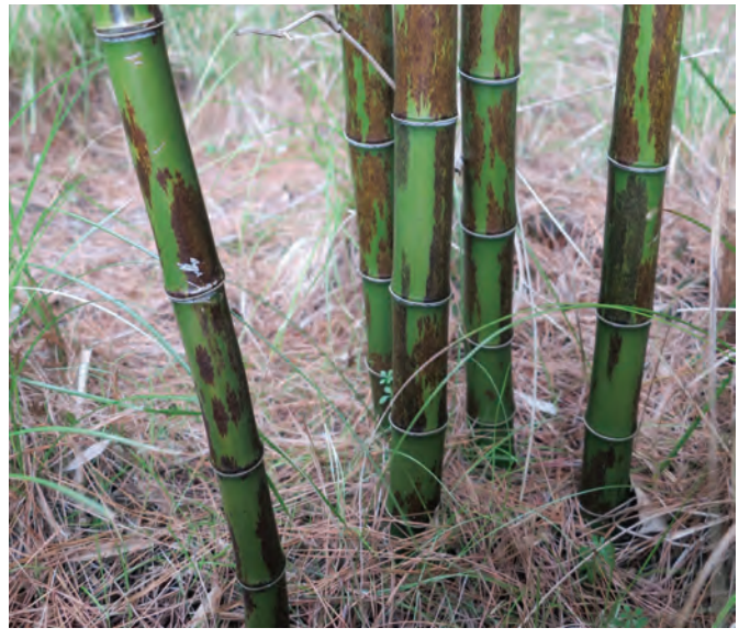
Fig. 5 Phyllostachys nigra var. henonis .

I'd like, also, to be able to say that the flowers were exciting, but there wasn't much to the few I have seen. If I hadn't known what to look for I might not have noticed them at all. They were inconspicuous; a bit like most other grass flowers, really. They might