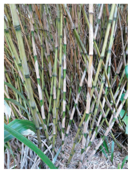
Fig. 1 Chusquea culeou .

To get a handle on how seldom bamboos flower in gardens, consider the fact that in most of the species the main morphological characters by which these plants are classified are not based on the flowers and fruits, as is usual, but on vegetative characters: stems, leaf-sheaths, leaf-blades, and so on.