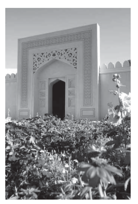
Fig. 1 The Trust that oversaw the development and fundraising for the new Indian Char Bagh Garden was made up of leaders from each of the different regional and religious community groups represented in the

The most successful partnerships have been those involving local cultural communities. The Chinese community became very involved in the Chinese Scholar's Garden