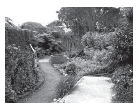
Fig. 3 The Sustainable Backyard Garden has been developed and is still maintained by the Hamilton Permaculture Trust. Trust members also provide open days and school training programmes.

more than two hundred trees and many more shrubs and herbaceous plants. Members of the Friends and passing members of the public all helped with the clean up.