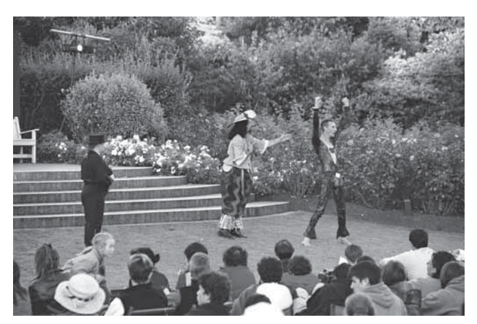
Fig. 6 Tour guides at Hamilton Gardens are encouraged to tell stories and capture the imagination of visitors. For example, they might refer to their own experience of a performance of Shakespeare on a warm summer evening in the Rose Garden.

Giveny in Rouen, France is said to be the world's most visited small garden. But it would not have even survived if it were not associated with the impressionist painter, Claude Monet. The crowds come in their tens of thousands every year because of this invisible association that can capture their imagination.