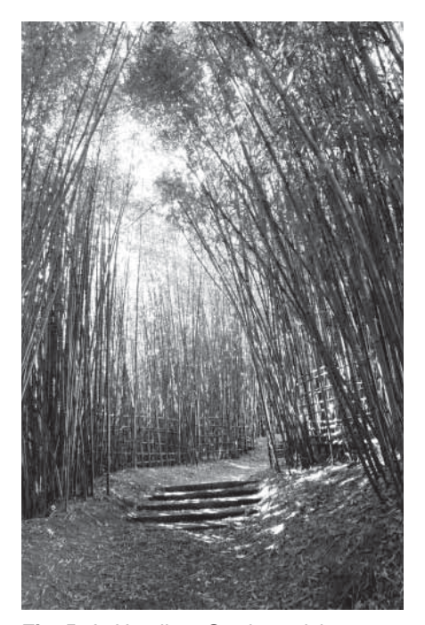
Fig. 5 At Hamilton Gardens visitors are deliberately crowded into narrow lanes and passages never knowing what they might find around the next corner.

favoured inscriptions that referred to new insights and surrealist associations, whereas the 18th Century Europeans preferred philosophical reflections. Thought provoking inscriptions appear to be enjoying some degree of revival, especially in France, largely driven by outdoor modern art, which is also intended to challenge our perception of the world.