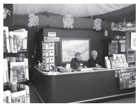
Fig. 2 A roster of about sixty members of the Friends of Hamilton Gardens have attended the Visitor Information Centre every day for the past decade. The Friends also keep a roster of about two dozen trained tour guides.

Direct community involvement in the Gardens does take longer to develop but it is obviously less likely to move on. We have now reached a stage where Hamilton Gardens has its own community of interest and certainly there is a lot of general community ownership. Recently, a tornado ripped through the upper portion of Hamilton Gardens destroying or damaging