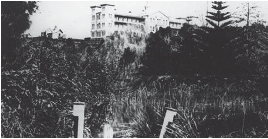
Fig. 3 Raupo ( Typha species) growing in Auckland Domain ponds late 1870s.