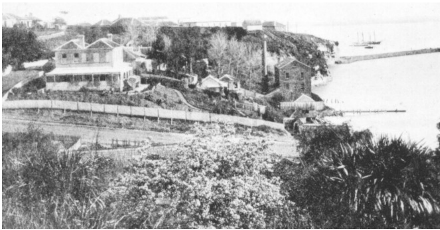
Fig. 2 Phormium tenax plants photographed in 1870 in Official Bay. Estimated age 50 years c.1820.

This same garden supplied rare trees to Auckland and North Island public landscapes from 1840 until the present. Trees growing today across the UNITEC campus in Auckland can be traced from this garden. In the winter of 1884, for example: