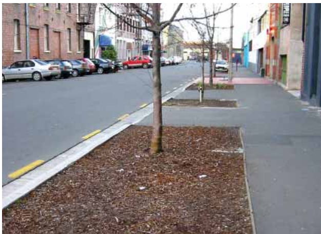
Fig. 5 Squared planter berms in central Christchurch..