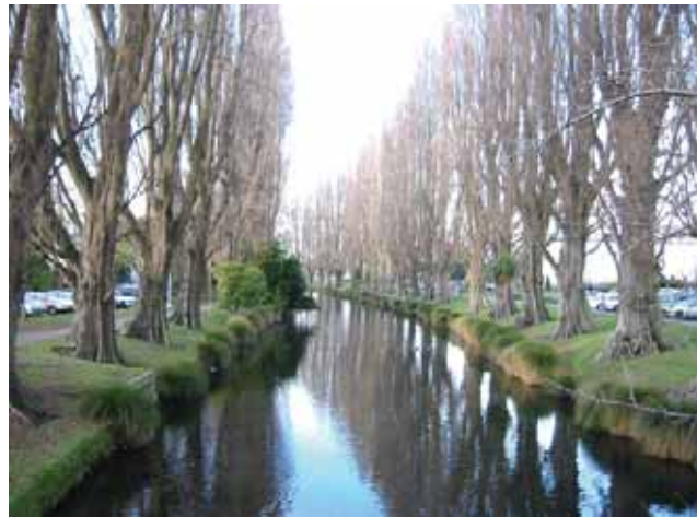
Fig. 12 The Avon River, flowing through Christchurch City presents opportunities to enhance waterways with plantings. (Photo: Nancy Simovic).