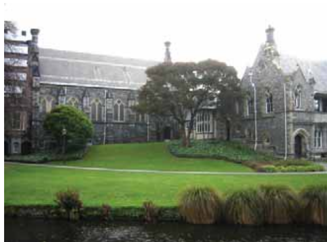
Fig. 14 A large New Zealand native specimen tree, akeake ( Dodonaea viscosa ), set against the Avon River and traditional English architecture provides a unique combination of elements.