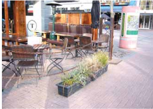
Fig. 10 Collection of natives poorly displayed in planter boxes outside a Christchurch café.