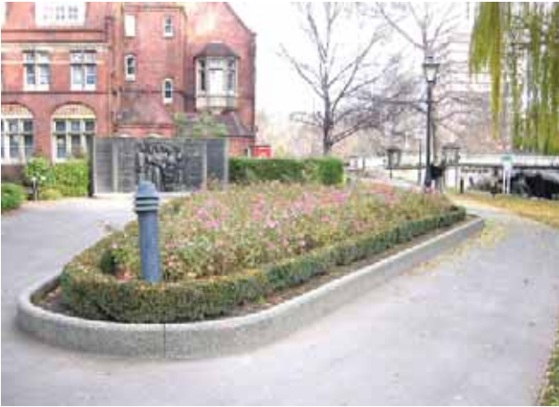
Fig. 9 Display bed in flower near the banks of the Avon River.