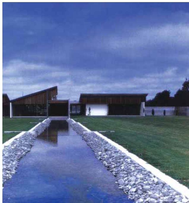
Fig. 2 Minimalist design on the Canterbury Plains.