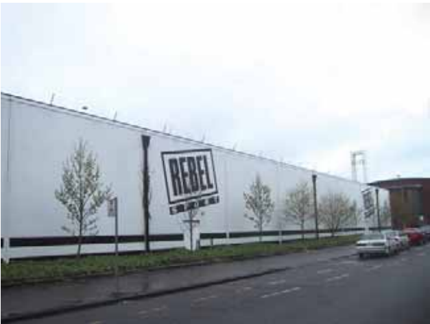
Fig. 11 The uninspiring expanse of a building wall ill-concealed by sparse plantings of deciduous trees. This building is in one of the most prominent positions in Christchurch, the intersection of Moorhouse Avenue and Colombo Street.