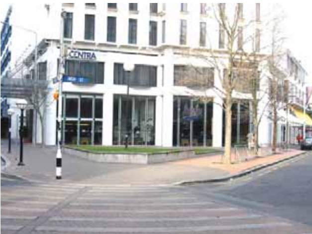
Fig. 13 An area outside the Centra Hotel, Central Christchurch, is planted in grass and lacks inspiration.