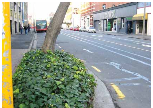
Fig. 8 Algerian ivy ( Hedera canariensis ) in Christchurch streetscape.