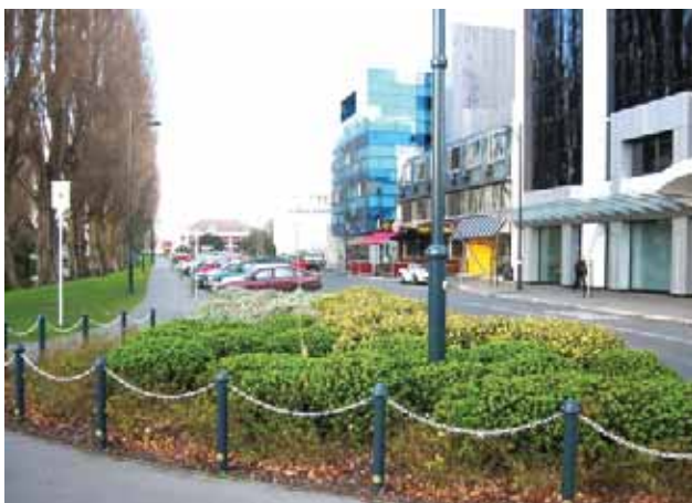
Fig. 7 Tough low planting in Christchurch streetscape.