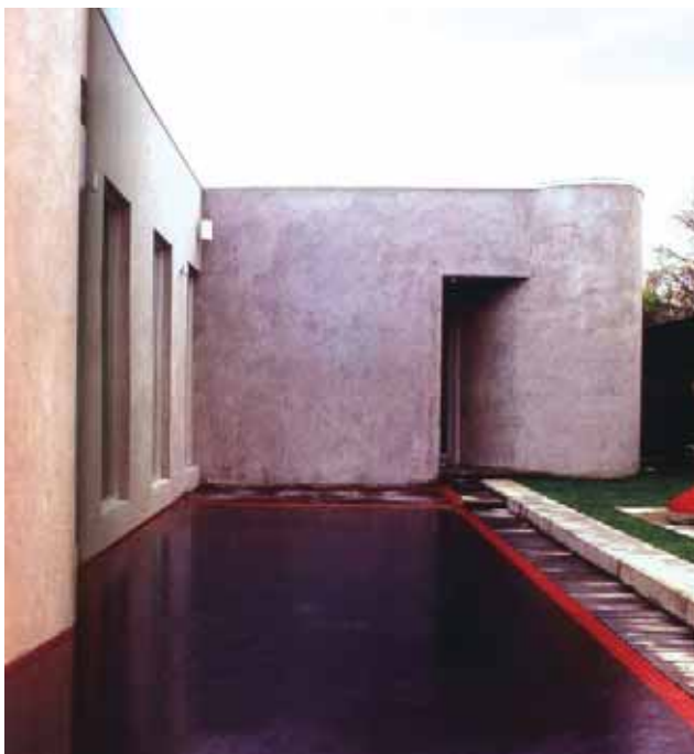
Fig. 1 Contemporary modern landscape design. (Photo: Trends magazine).