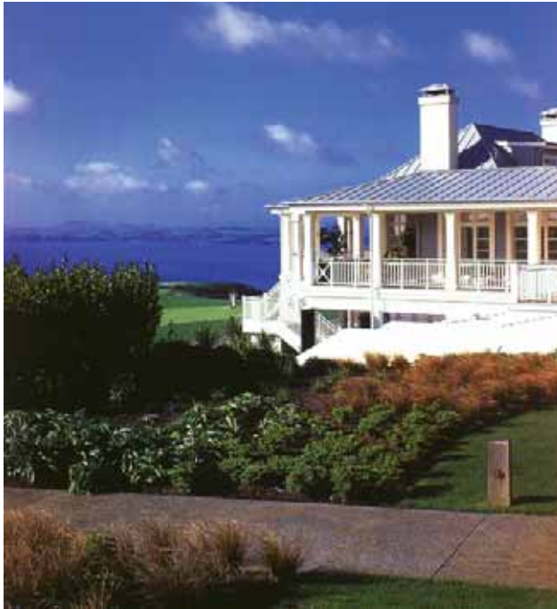
Fig. 3 Colonial style house with mass planting of natives. (Photo: Landscape New Zealand magazine).