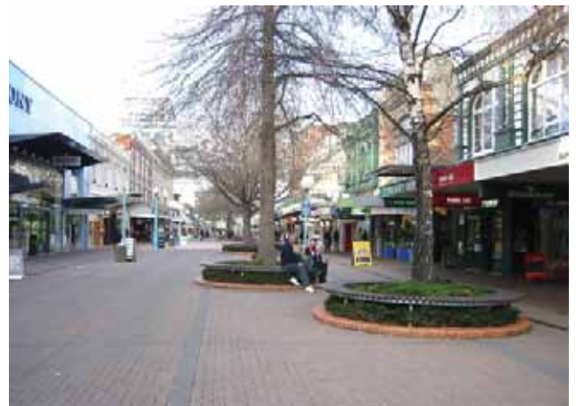
Fig. 6 Tree planters in Cashel Mall, Central Christchurch. (Photo: Simon Fenwick).