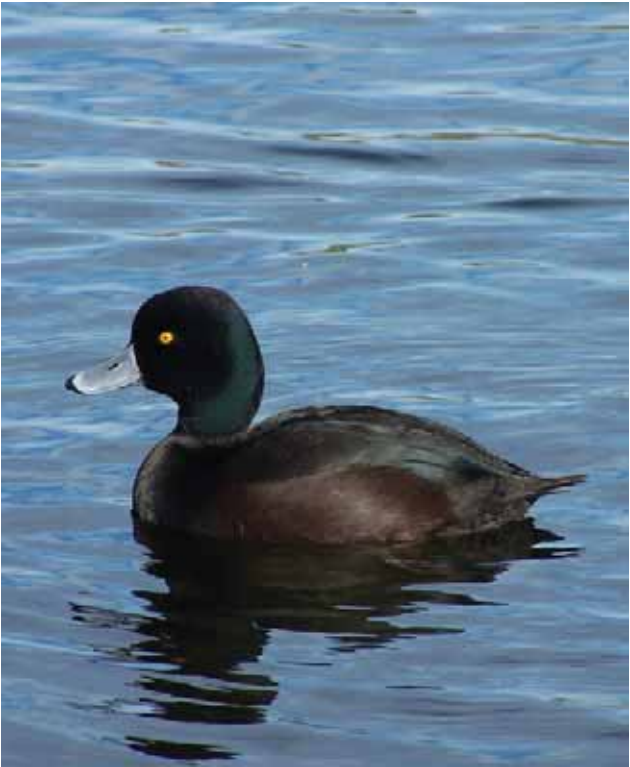
Fig. 3 New Zealand scaup ( Aythya novaeseelandiae )..