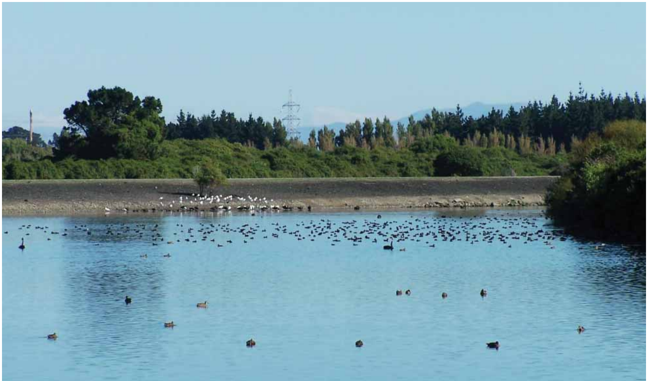
Fig. 1 Waterfowl and royal spoonbills ( Platalea regia ) at Bromley Oxidation Ponds.