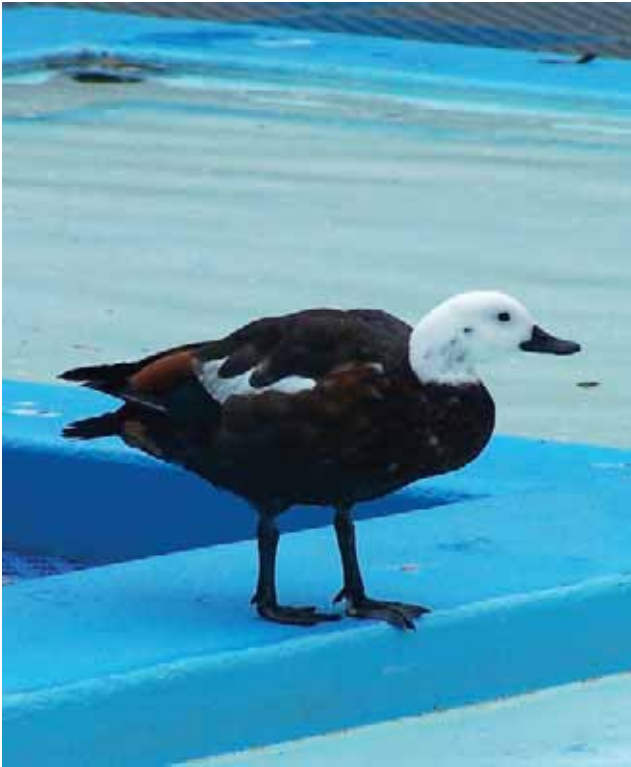
Fig. 4 Paradise shelduck ( Tadorna variegata ) on a swimming pool in metropolitan Christchurch.