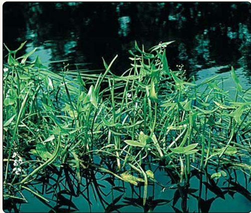
Arrow-shaped leaves carried above the water