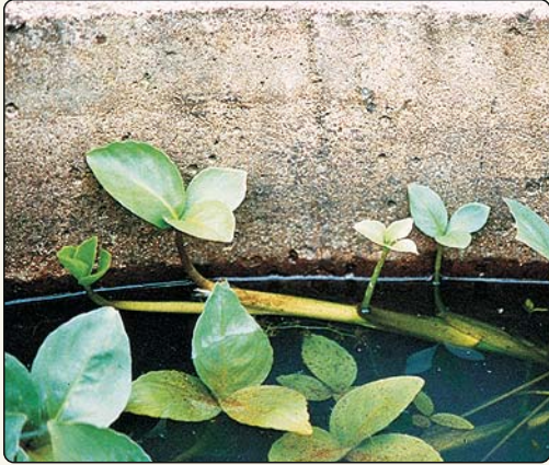
Light green leaves, hairless with three lobes