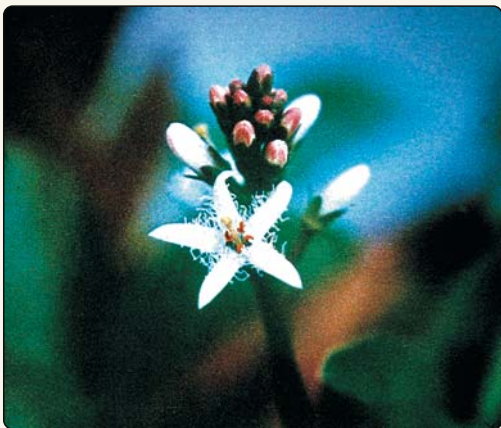
Inner petals are white and hairy

Bogbean is a perennial plant that can grow in bogs and marshes and at the fringes of lakes or slow flowing rivers.