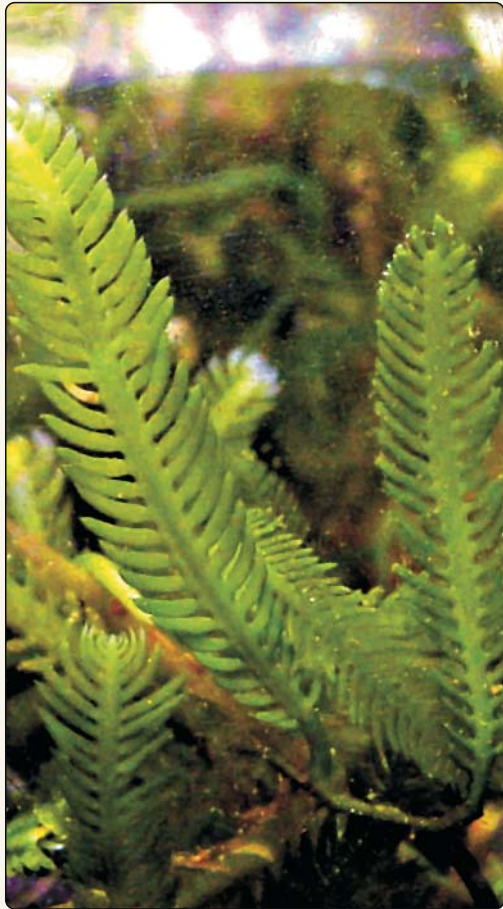
The feather-like fronds grow upwards

Certain strains of the green alga Caulerpa taxifolia are highly invasive and can cause major ecological and economic damage. Caulerpa taxifolia was originally cultivated as an aquarium plant and now infests large areas of the Mediterranean Sea.