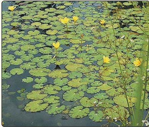
Heart-shaped leaves, with scalloped edges