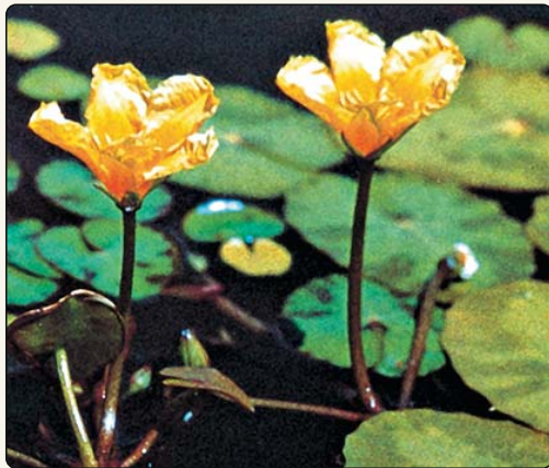
Yellow flowers October through to April

Fringed water lily is a freshwater aquatic, robust, bottom-rooted perennial with long, branched, creeping stems that lie just below the water surface producing dense mats of floating leaves.