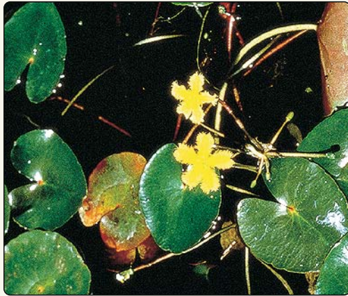
Heart-shaped leaves up to 8cm across