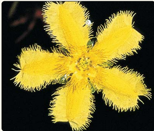
Distinctive fringed wing around the petals