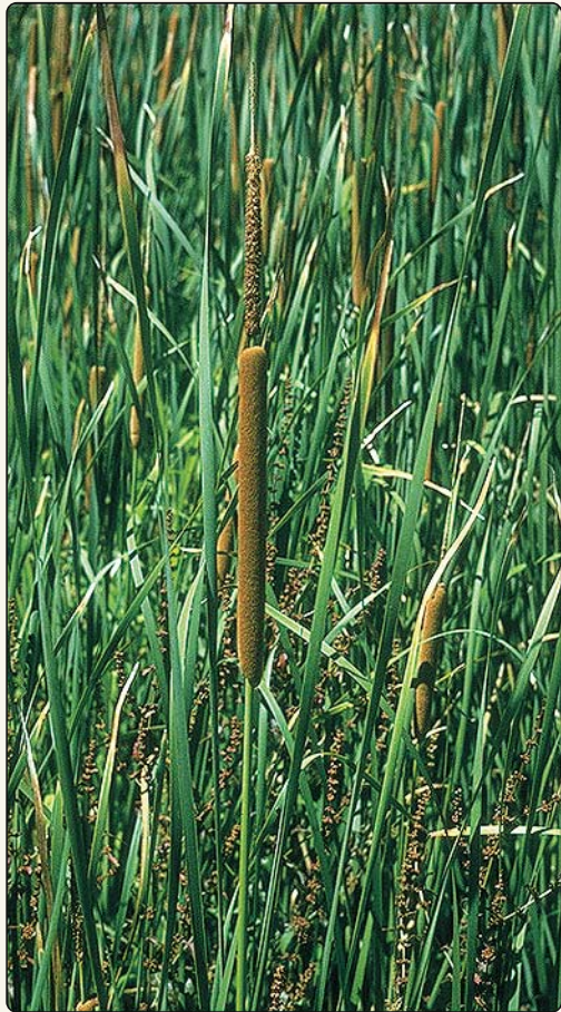
Brown erect sausage-shaped flower spikes