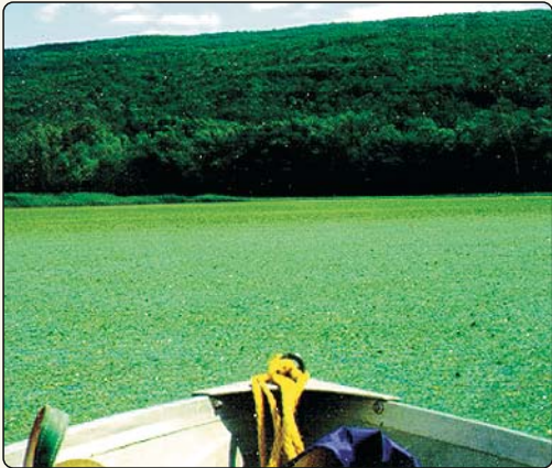
Forms large, floating mats

Water Chestnut is an annual, floating aquatic plant, grown as a food plant in Asia. Usually rooted in the mud of ponds, lakes and rivers, it can become amphibious on wet, muddy land and frequently forms large, floating mats.