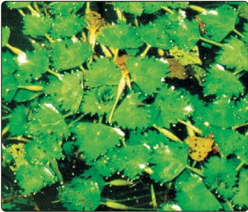
Leaves cluster in a floating rosette