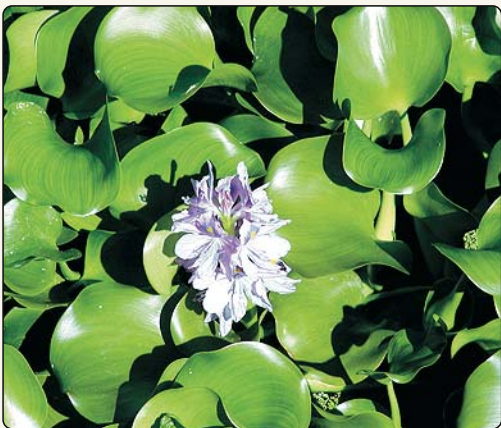
Large, lavender-coloured flowers

Water hyacinth is a perennial freshwater aquatic plant that floats on the surface of still and slow-moving streams. It grows extremely quickly, and just 25 plants can produce a mat of over one hectare in a single growing season. It is frost sensitive, but some plants within dense mats can survive moderate frosts.