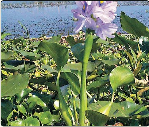
Grows extremely fast and forms dense mats