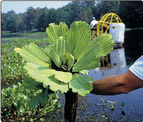
Densely crowded rosette of leaves

Water lettuce is a perennial freshwater aquatic plant that floats on the surface of still water and slow-moving streams. It is only likely to establish in northern parts of the North Island.