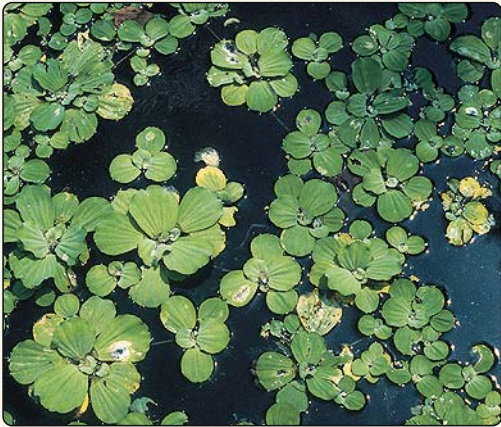
Floats on still and slow-moving streams