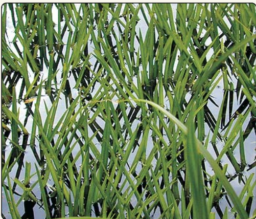
Made up of prickly and brittle leaves

Water soldier is a perennial aquatic weed that grows in sheltered backwaters, ponds and ditches in temperate climates.