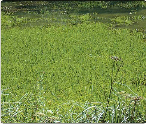
Grows in sheltered ponds and ditches