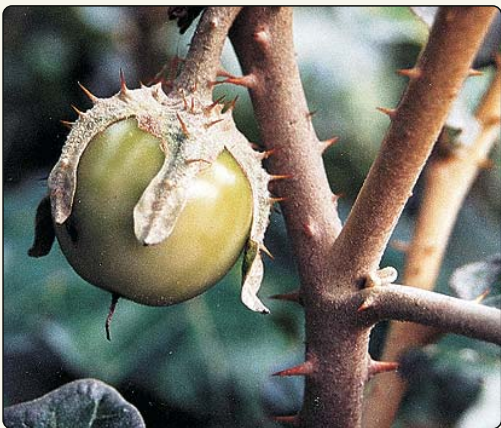
Green berries go yellow as they ripen

White-edged nightshade is a perennial shrub that can grow up to 5 m high. It is easily recognised by its characteristic prickly leaves that have chalky white undersides and edges of the upper side.