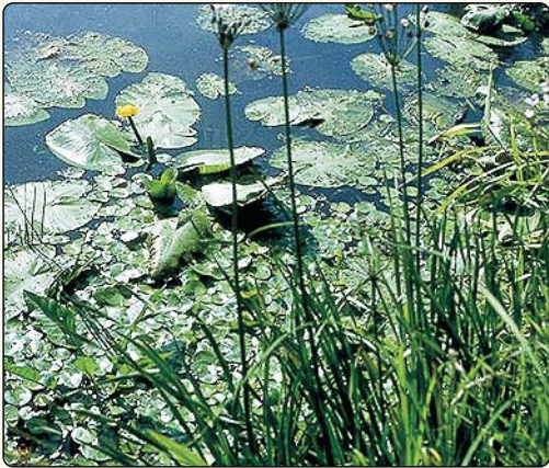
Leathery, green floating leaves