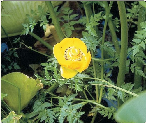
Flowers smell strongly of alcohol

Yellow water lily is a perennial aquatic plant that grows from the waters edge to 2m in depth in lakes and slow flowing streams.